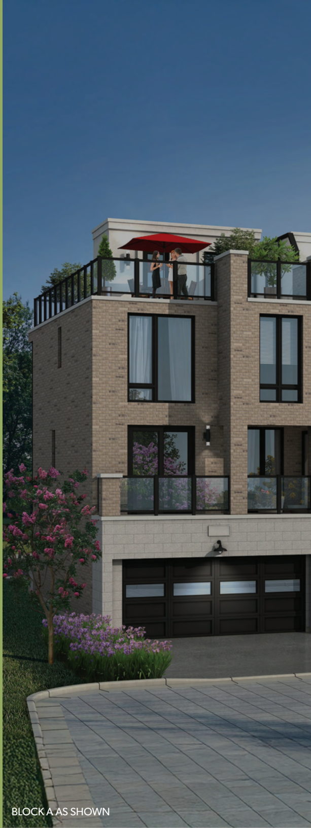
BLOCK A AS SHOWN