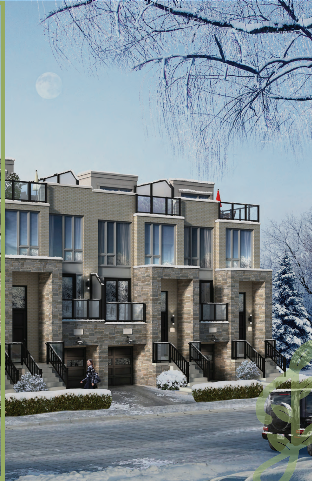
BLOCK F AS SHOWN