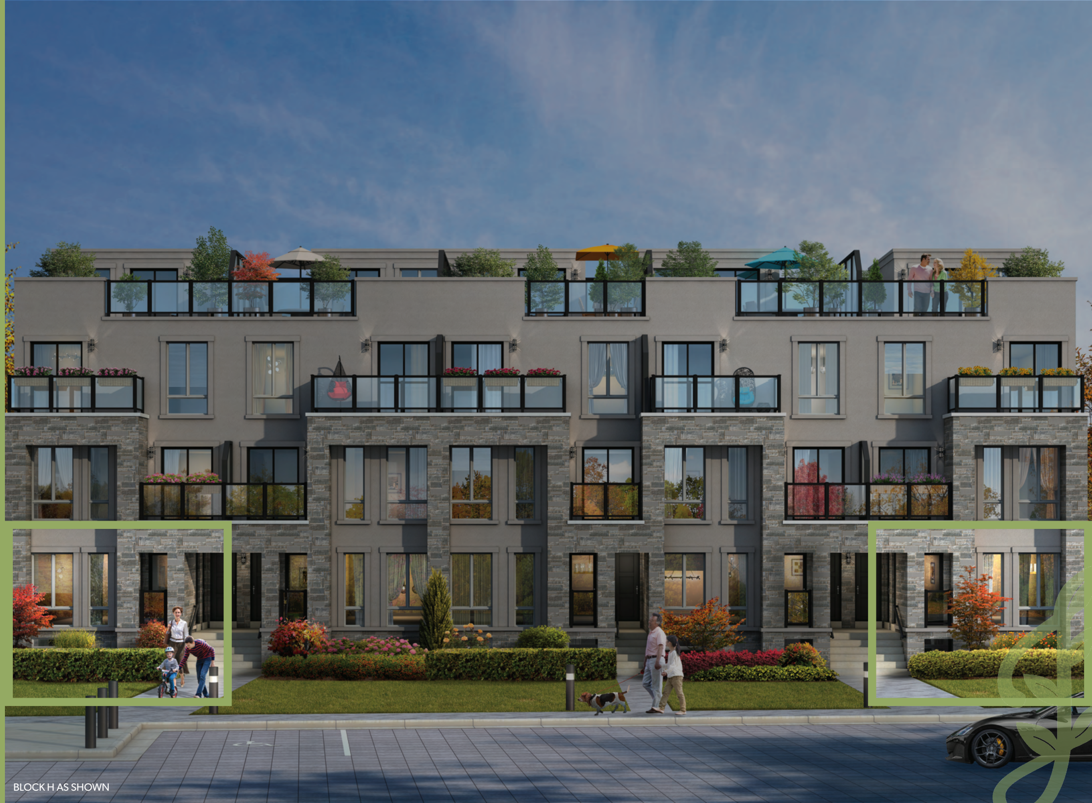
BLOCK H AS SHOWN