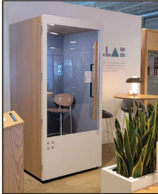
#Private Phone Booth