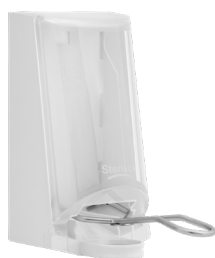
Art. no. 4567