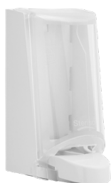
Art. no. 4551