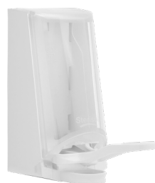
Art. no. 4547