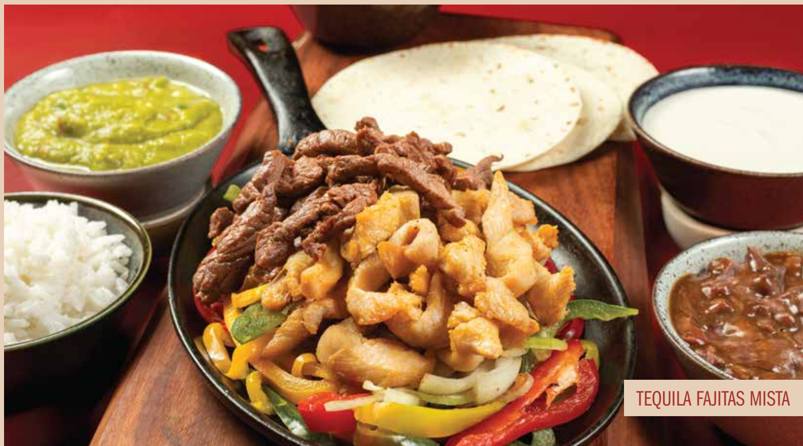
TEQUILA FAJITAS MISTA