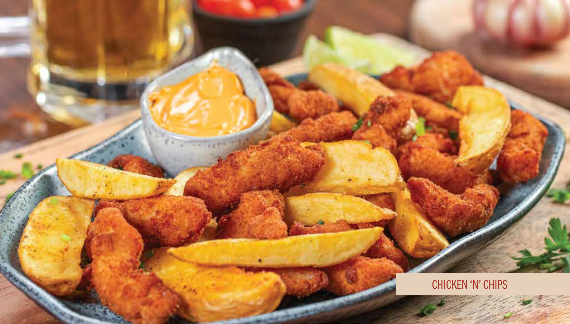
CHICKEN 'N' CHIPS