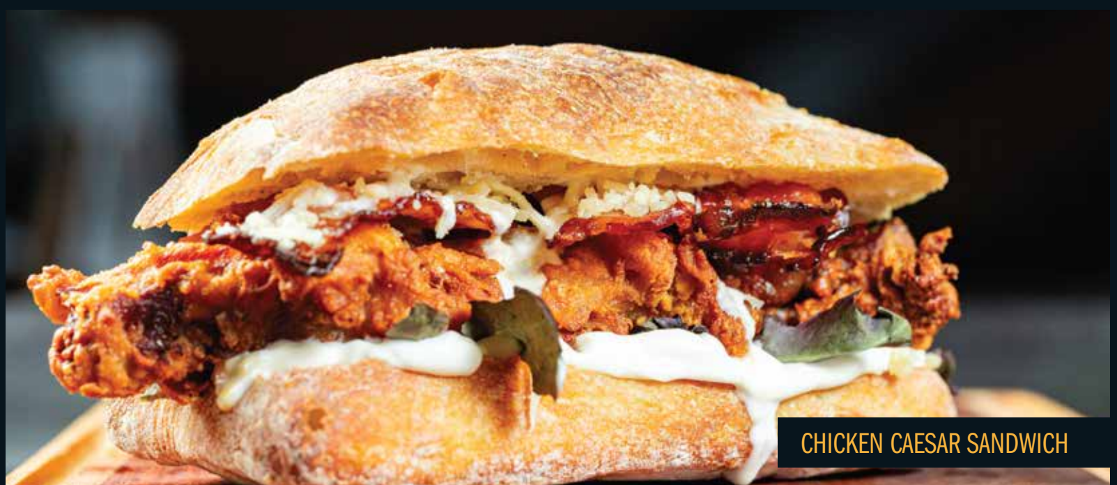
CHICKEN CAESAR SANDWICH

Delicious steak strips seasoned by the chef, topped with a generous layer of melted cheese, black olives, carrots, red leaf lettuce, and Grill sauce, served on ciabatta bread. Comes with Mustang Sally special mayo.