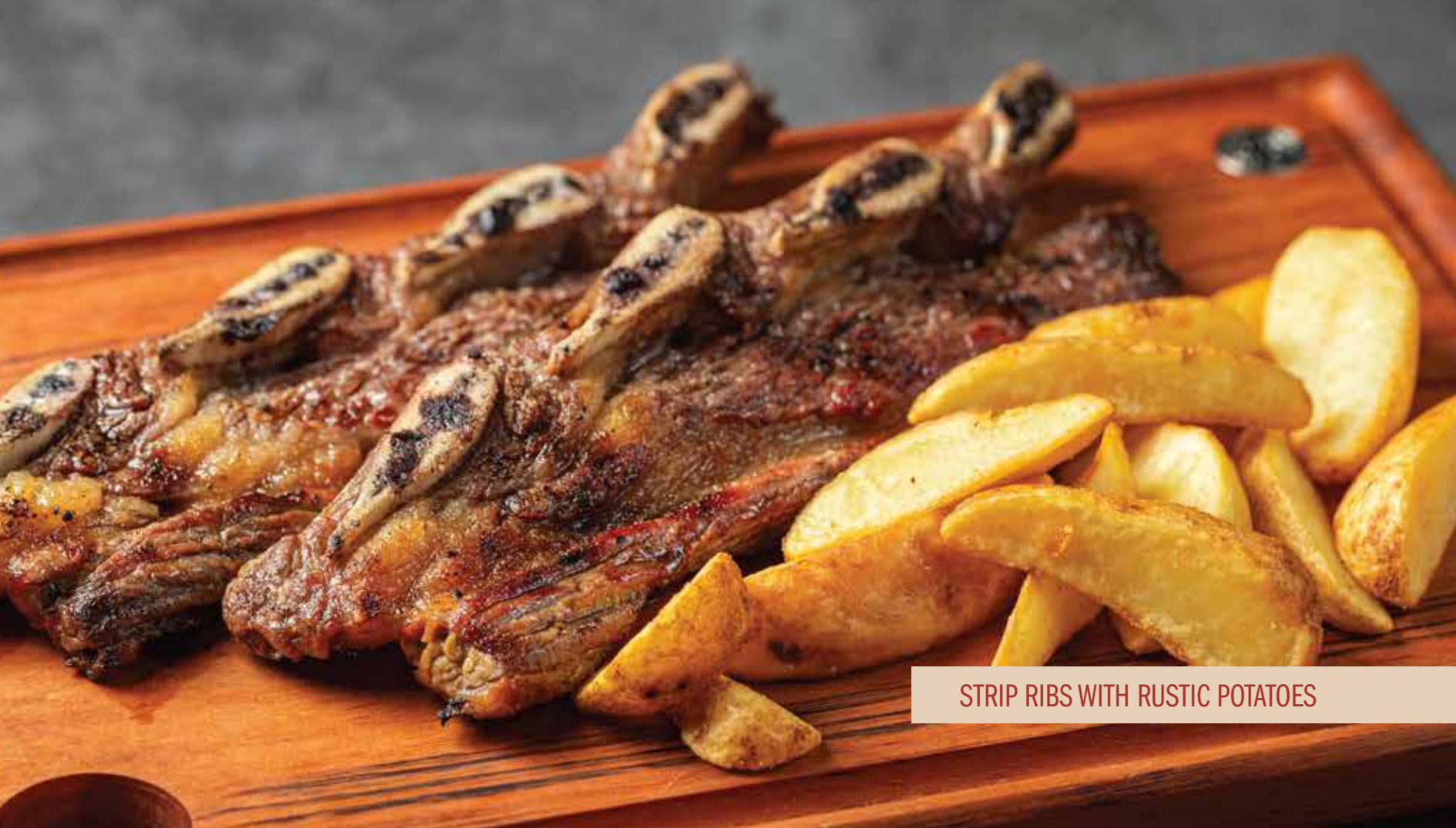
STRIP RIBS WITH RUSTIC POTATOES