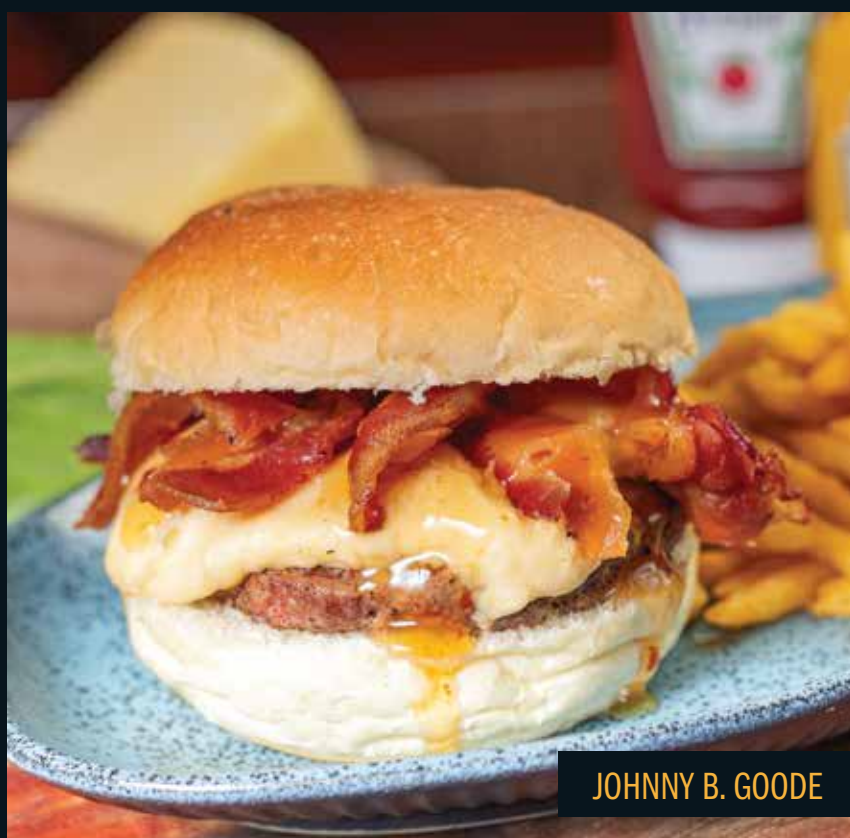
JOHNNY B. GOODE

Sourdough bun with breaded chicken thigh, iceberg lettuce, cream cheese, Buffalo sauce, and Mustang Sally special mayo. Served with fries.