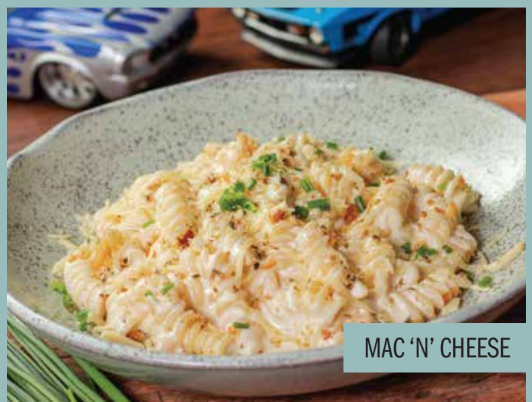
MAC 'N' CHEESE