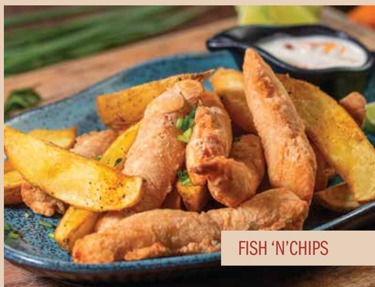
FISH 'N' CHIPS

Juicy strips of top sirloin (approx. 400g = 14,1oz) served with rustic potatoes and barbecue sauce.