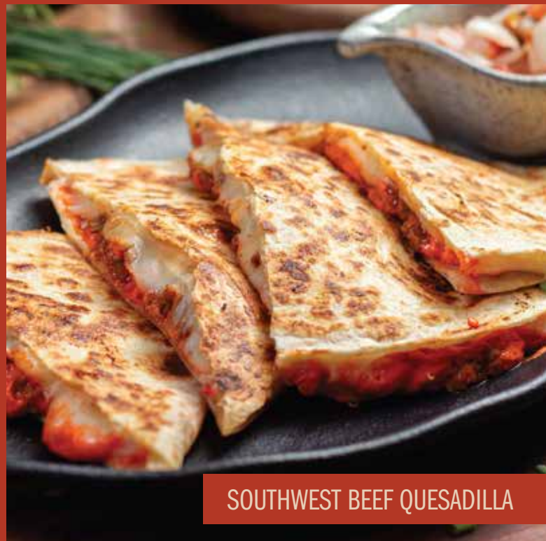
SOUTHWEST BEEF QUESADILLA