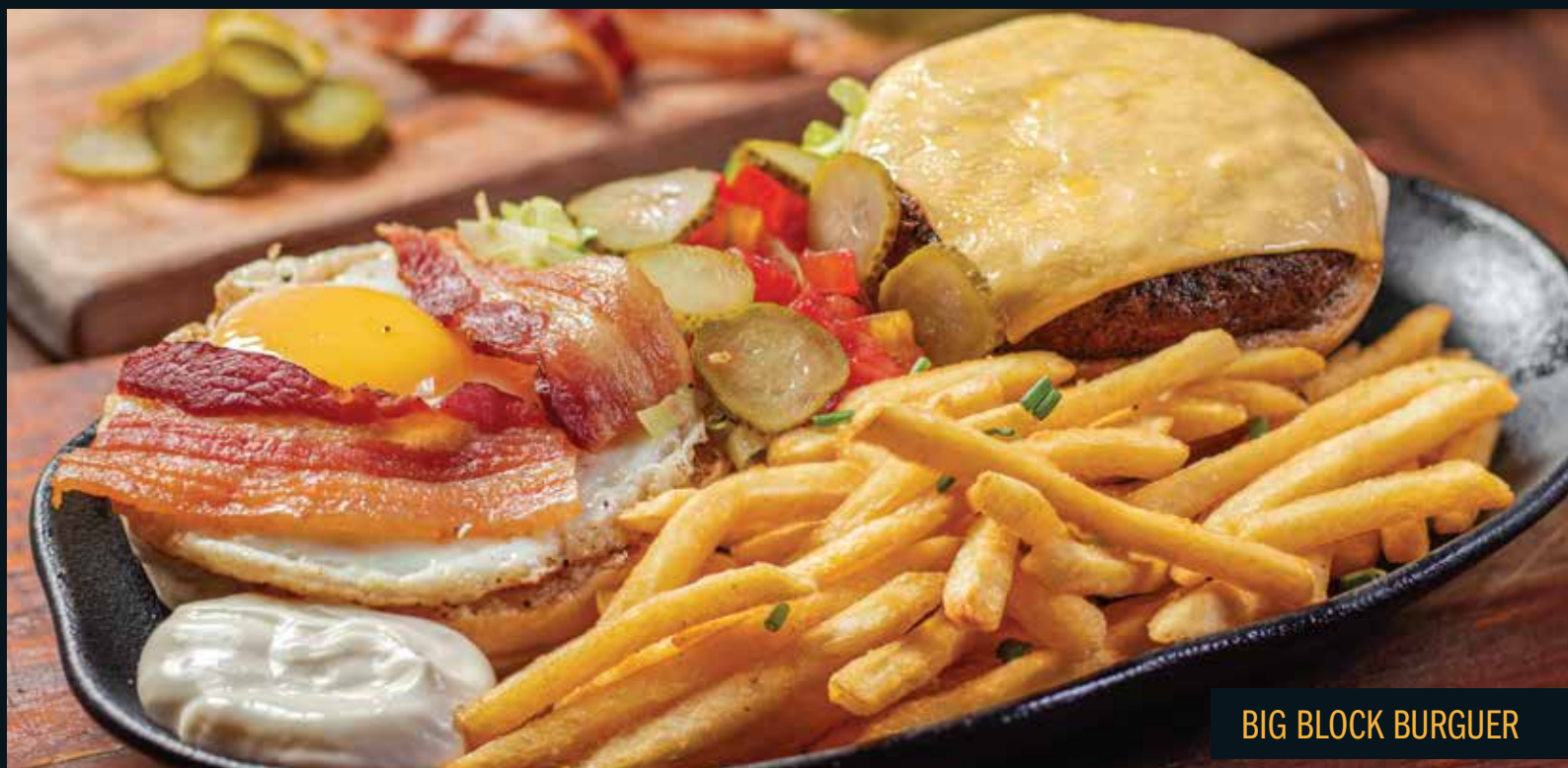
BIG BLOCK BURGUER