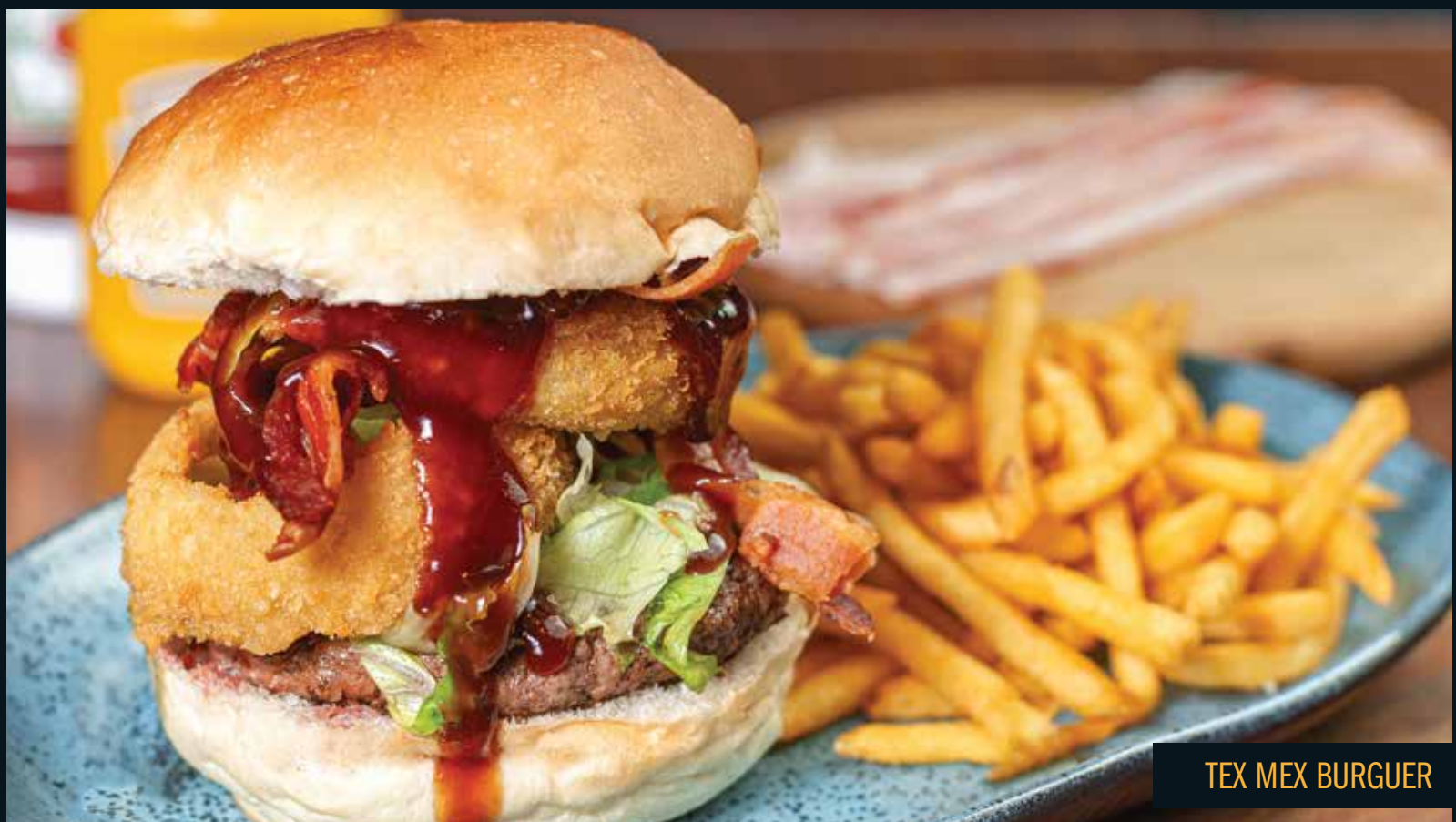
TEX MEX BURGUER

Our mayonnaise contains milk, egg, soy, and shellfish derivatives.