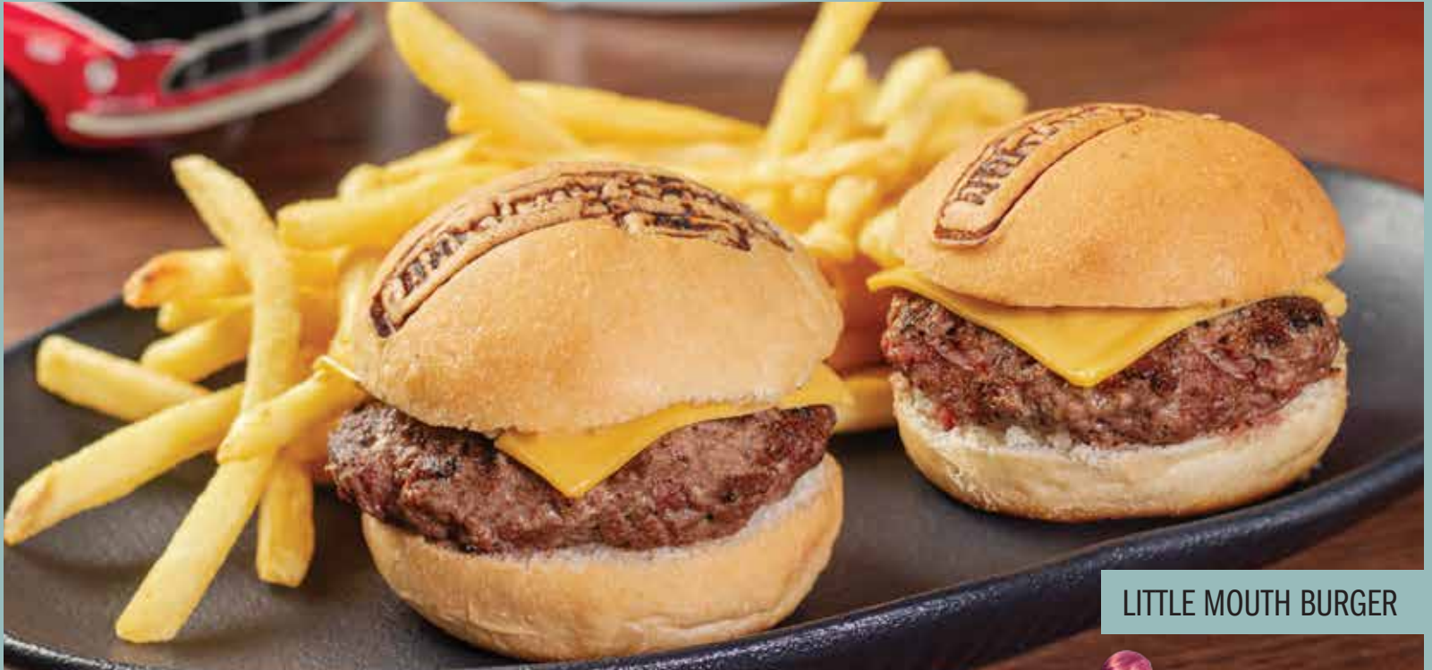
LITTLE MOUTH BURGER