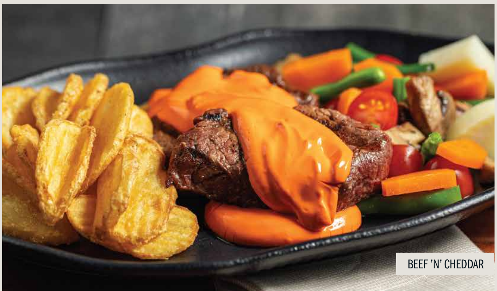
BEEF 'N' CHEDDAR

ADDITIONAL GRATED PARMESAN CHEESE: +R$ 5