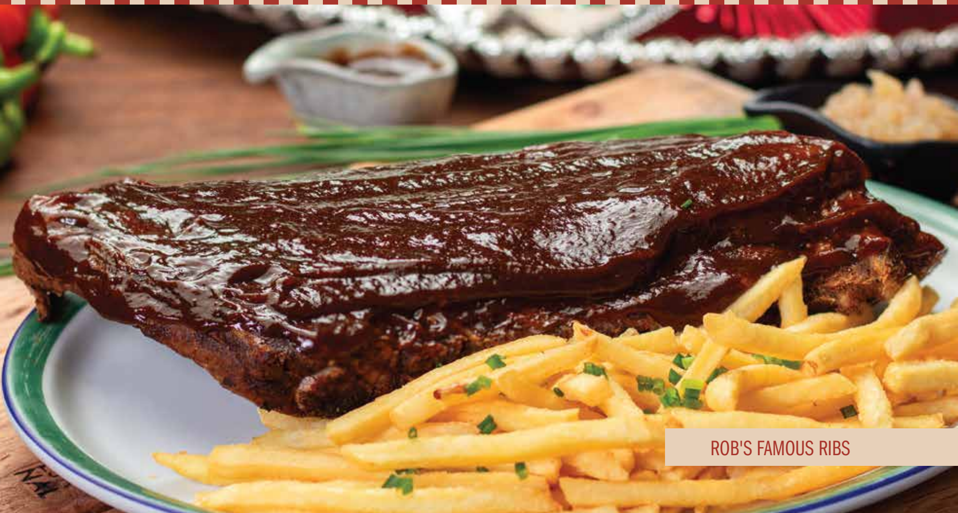
ROB'S FAMOUS RIBS