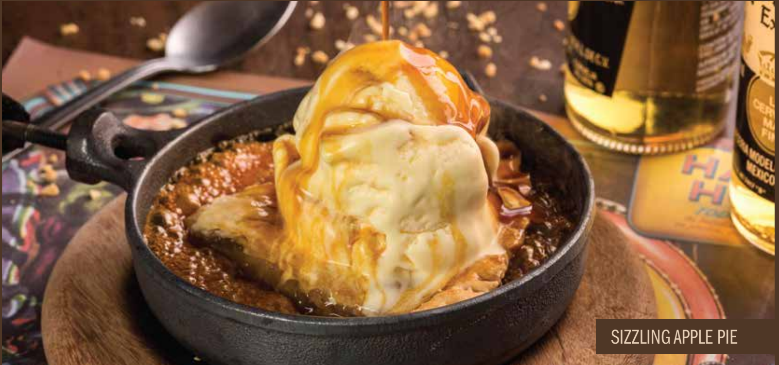
SIZZLING APPLE PIE