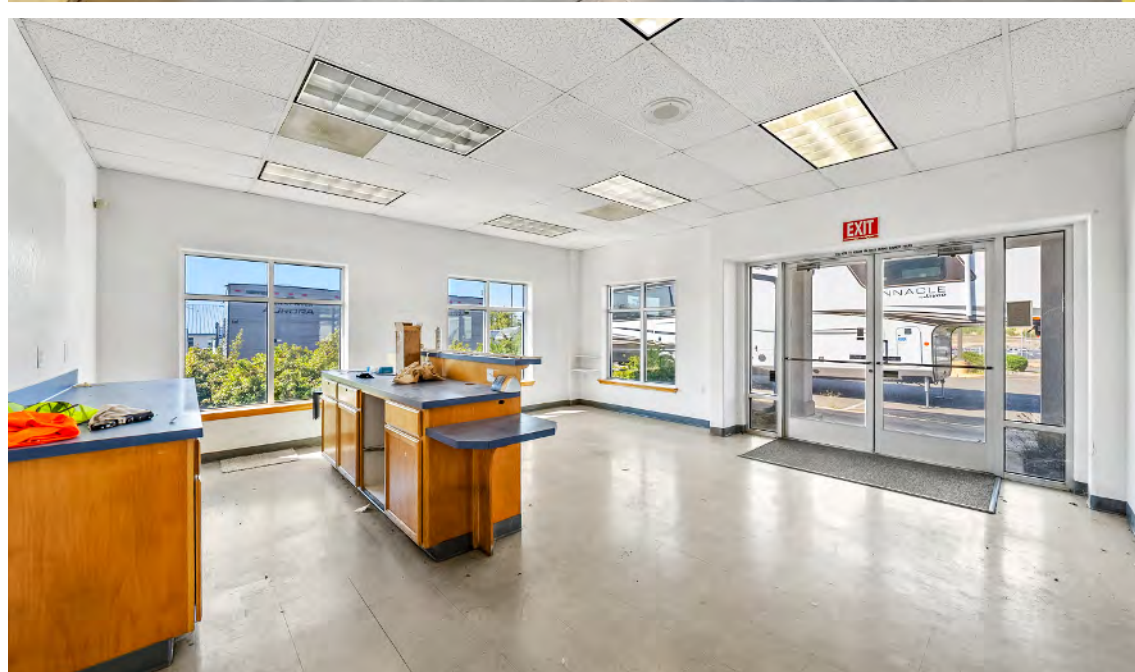
Interior Photos - Shop