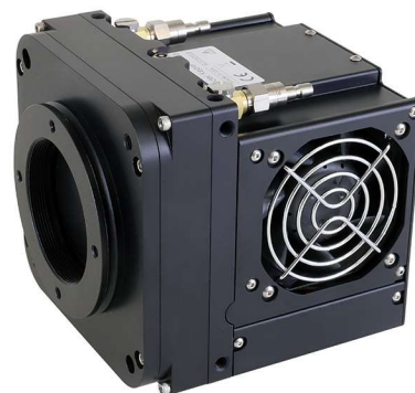
KL4040 without shutter