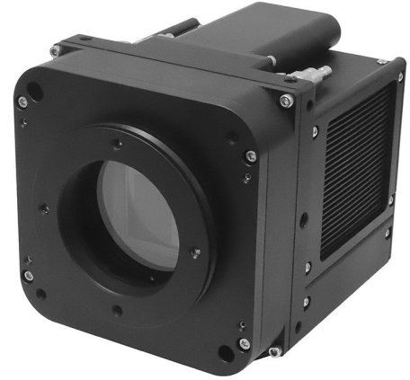
Aurora with FLI Dovetail Flange

1 Cameras are plumbed for liquid circulation; External liquid circulation connectors sold separately.