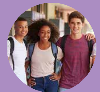
Dayton High School