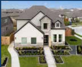
Long Lake Ltd.