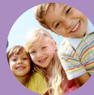
Stephen F. Austin Elementary