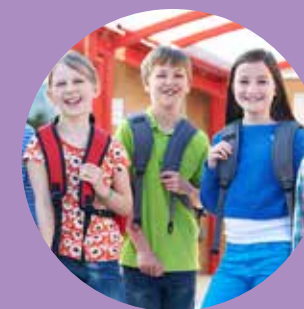
Woodrow Wilson Junior High