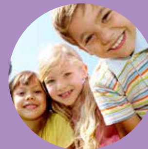
Stephen F. Austin Elementary