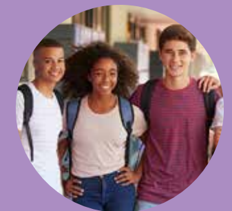
Dayton High School