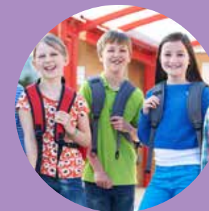
Woodrow Wilson Junior High