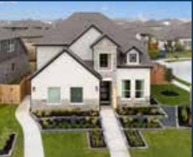
Long Lake Ltd.