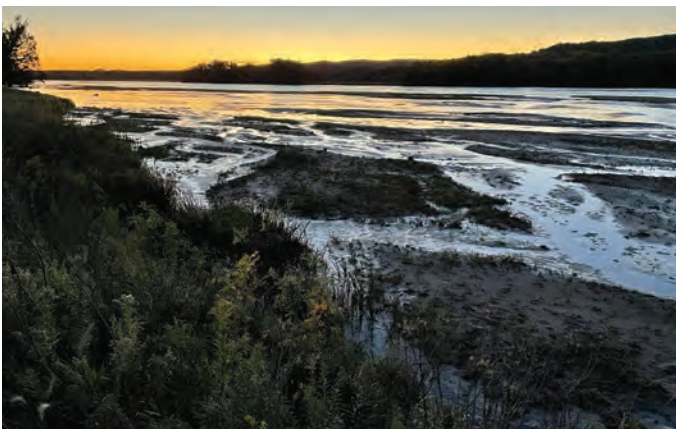
Sunset over the Niobrara River as viewed from Hutton.

We've all seen videos of salmon jumping out of the water to get over a small waterfall. They do this to get upstream to spawn. But have you ever wondered how small fish move upstream? Even though small fish do not make long-distance migrations like salmon, they do move up and down streams to take advantage of available food sources and access suitable habitats for various life stages. However, culverts that pass under roads can create a hindrance to their movements. As culverts age, a deep pool generally forms on the downstream side due to erosion, creating a drop in a couple inches to a couple feet of elevation between the drain and the surface of the pool. There is no way a fish a couple inches long could possibly climb if the distance was more than a couple inches.