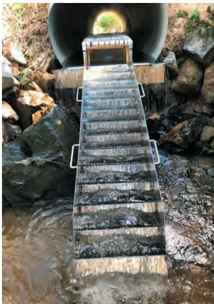
Hutton fish ladder.

create a series of pools with 1-2 inch elevation changes between each pool. This allows little fish to move upstream. One of these fish ladders was tested on Willow Creek on the Hutton Niobrara Ranch Wildlife Sanctuary for one week in mid-June. Before installation, a crew from Nebraska Game and Parks surveyed the fish above and below the culvert to see what is currently present. When the fish ladder was installed, they also placed a trap at the top of the ladder to determine which fish used it. After the one week study, it was found that blacknose dace had used the fish ladder to travel upstream. The researchers from Nebraska Game and Parks were pleased, not only because the fish were able to use the ladder, but also that the ladder withstood a heavy rainfall event. AOK plans on working with Nebraska Game and Parks to install a permanent ladder in the future.