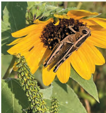
Two-striped Grasshopper ( Melanoplus bivittatus ) on sunflower.