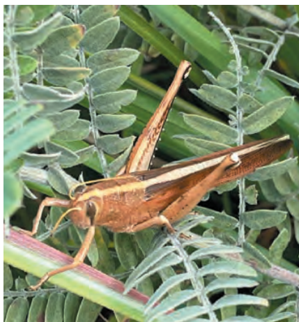
Spotted Bird Grasshopper ( Schistocerca lineata )