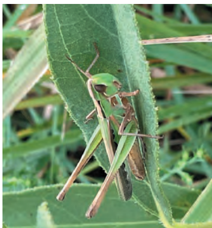
Admirable Grasshopper ( Syrbula admirabilis )