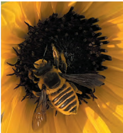
Flat tailed leafcutter ( Megachile mendica ) on sunflower.