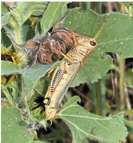
Differential Grasshopper ( Melanoplus differentialis )

identifications of species. If two people agree on an identification, it is considered a ‘research grade’ observation.