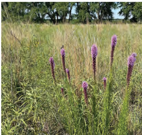
Blazing star within a pollinator plot at Achterberg.

This 240-acre property is a special central-Kansas farm in Lincoln County. Creeks meander through substantial forest and diverse habitats that were once common on Kansas farms. AOK has planted filter strips of native grasses and wildflowers along the edge of every field. Pollinator habitat complements an eight-acre remnant prairie meadow. Brown thrashers, wild turkeys, kingbirds, woodpeckers, and wrens are among the regulars.