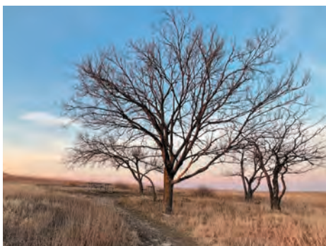
Mount Mitchell in March.