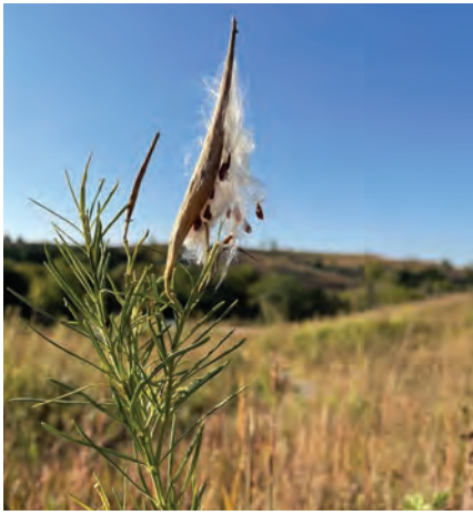
Whorled milkweed ( Asclepias verticillata )