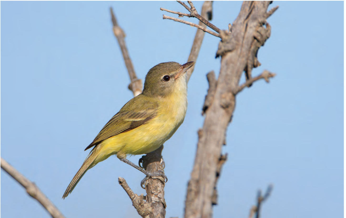
Bell's Vireo.