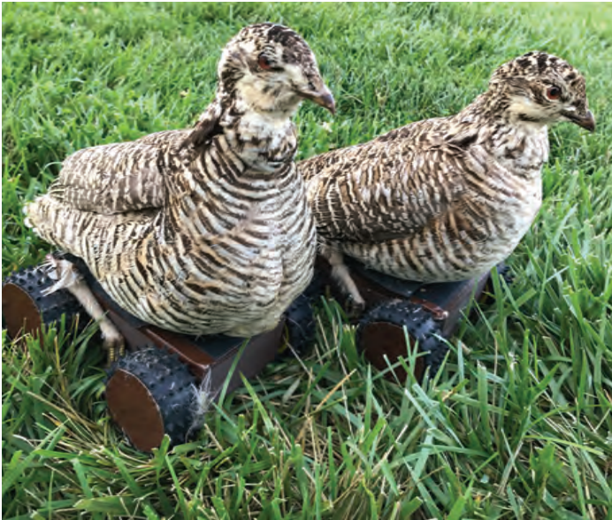
Jackie's decoy Prairie-Chickens—four-wheeled Galliforms