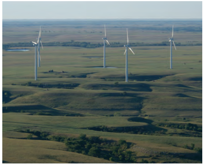
Wind turbines on formerly intact prairie south of Beaumont, Kansas.

Many grassland bird species are an object of concern because of falling populations and reduced habitat nationally, but in the limited number of observations on the Achterberg Farm, other than non-breeding meadowlarks, no Prairie-Chickens,