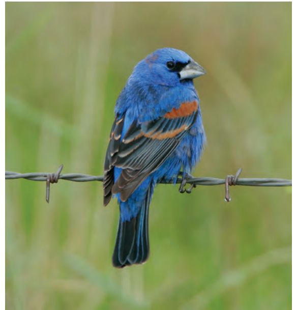
Blue Grosbeak male.