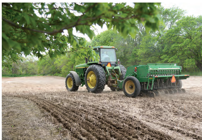
Heavy work preparing pollinator field

Those differing cover types, including vegetation that is often referred to as annual weeds, are important as sources of invertebrates for young quail chicks and for many passerine