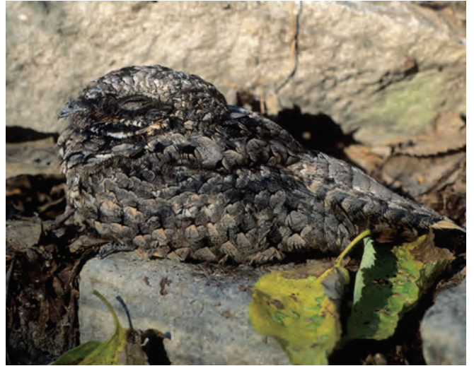
Common Poorwill.