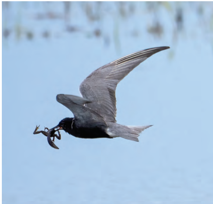
Black Tern with Bullfrog tadpole

The glare of a Burrowing Owl always suggests to me that if the bird ever dreamed it were a mammal, it would appear as