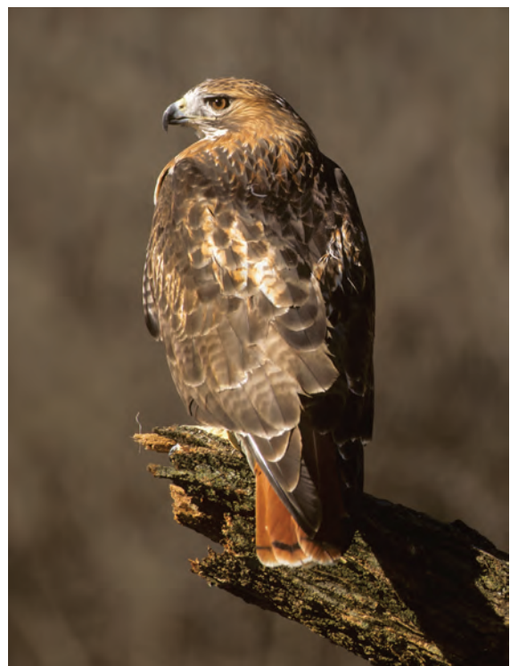
Red-tailed Hawk.