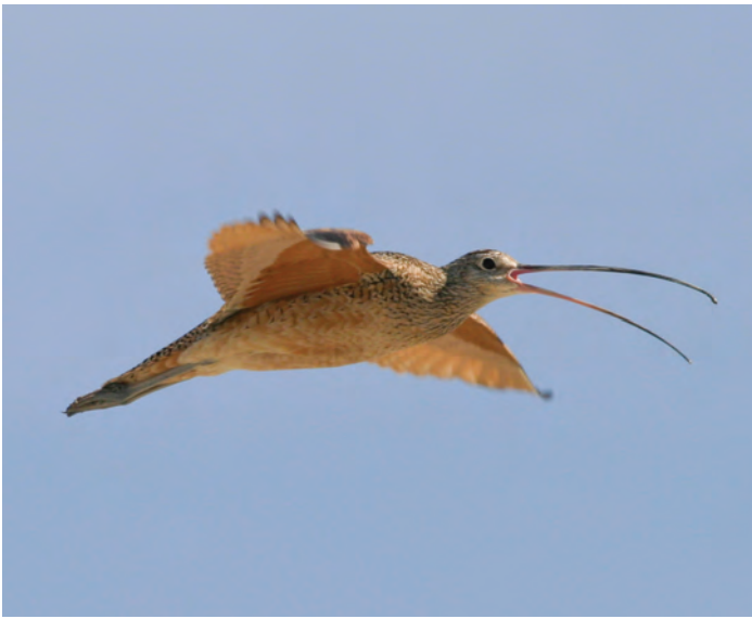
Long-billed Curlew.

Assessment of direct impact might seem simpler, but John Schukman notes that even with careful preliminary bird data, it is often difficult to interpret how mortality of birds might be affected by a given event—such as the introduction of wind turbines. One study concluded that “there was no clear relationship between predicted risk and the actual recorded bird mortality at wind farms.” The assumption of a linear relationship between frequency of observed birds and fatalities proved to be incorrect. “Bird mortality in wind farms is related to physical characteristics around individual wind turbines,” while Environmental Impact Assessments usually take in the whole wind farm as a unitary entity. Research needs to be species-specific, and focused on specific features of the proposed location. It would also need to consider seasonal changes in conditions, as well as nocturnal and diurnal factors. In other words, the more narrowly specific, the more granular the assessment, the more likely that it accurately represents the actual case for any given machine; the sum of individual cases would give the range of likely mortality on the site (Ferrer et al. 2011).