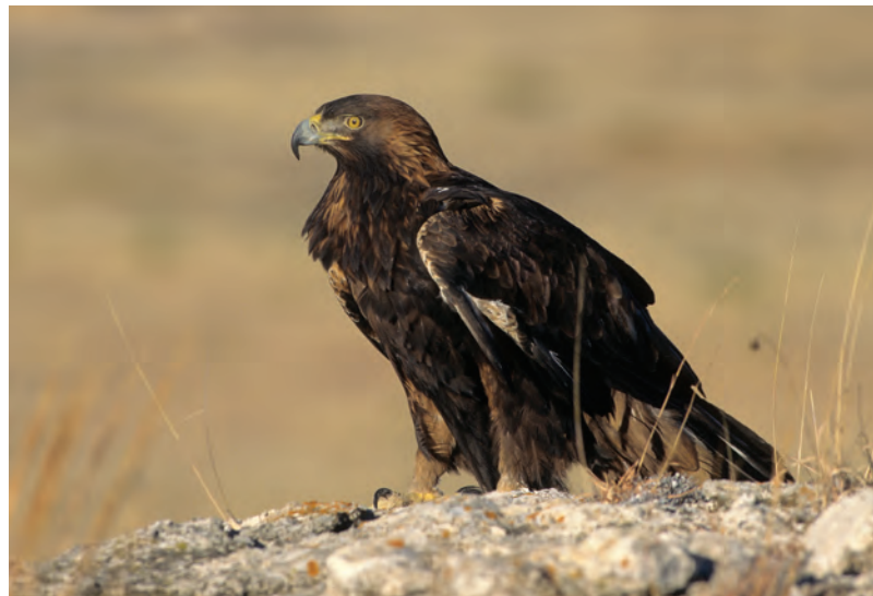
Golden Eagle.

When endangered species are at risk, comparing domestic cat kills with wind turbine mortality is beside the point. Some deeply disturbing incidents have been documented, particularly involving raptors. Wind farms first appeared in the United States in the early 1980s. One of the first big