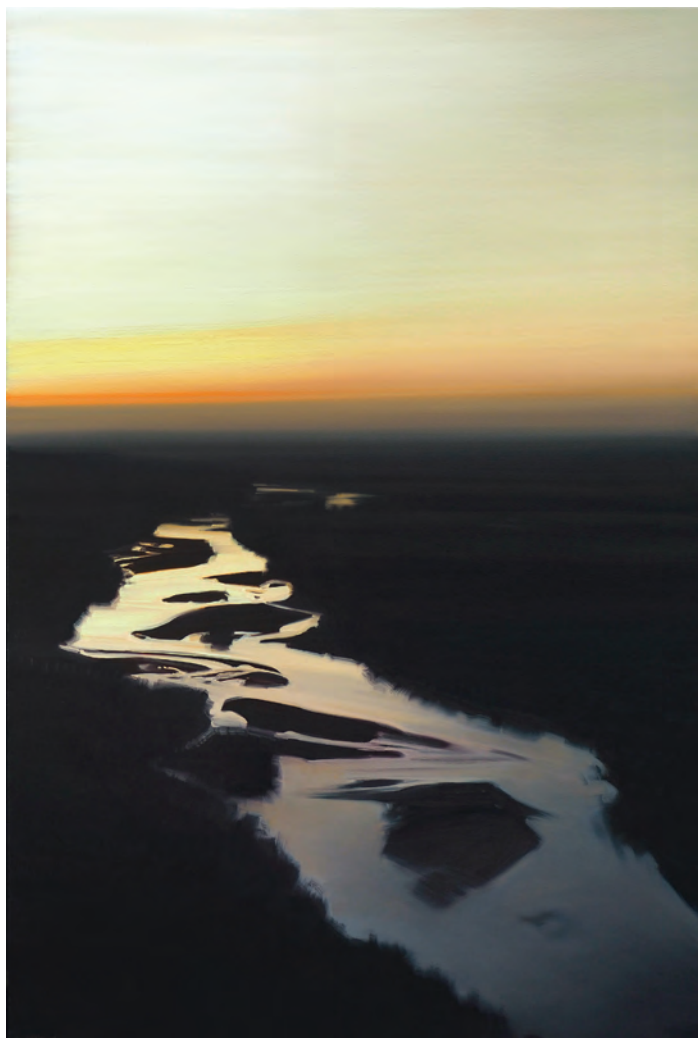
The Kansas River threads its way through sandbars and a darkening prairie.