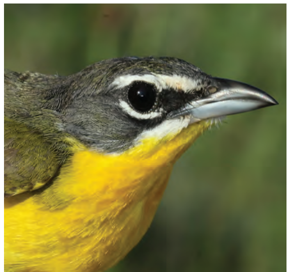
Yellow-breasted Chat.