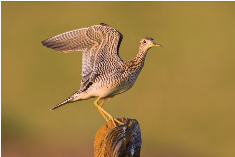
Upland Sandpiper.