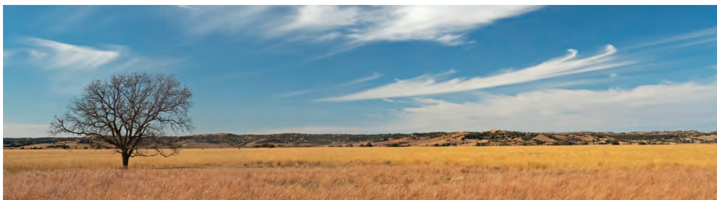
Hutton Ranch Savanna