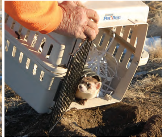
The late Larry Haverfield releases a Black-footed Ferret (BFF) on the Haverfield/Barnhardt/Blank ranch complex on December 18, 2008. It was among the first fourteen released there that day. Previously the last BFF documented in the state was in 1957.

Black-tailed Prairie Dog colonies are somewhat like wetlands in shortgrass prairies. They are magnets for a diverse array of other wildlife species. To restore critically endangered Black-footed Ferrets, we need to support and allow landowners to conserve prairie dogs on their land.