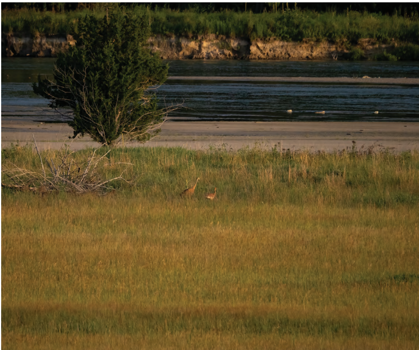
Sandhill Crane pair with colt, Hutton Ranch