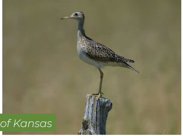
Upland Sandpiper