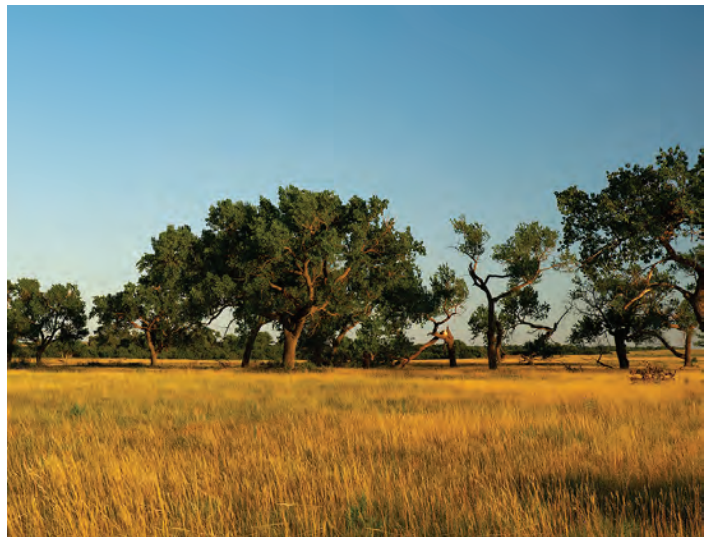
"Grassland draped beneath palisades of cottonwoods"

It's a fine thing to be held in the gaze of a Burrowing Owl. She could be sizing us up, taking the measure of our environmental ethic. She could be looking through us to a possible future. Or she could be doing neither at all, judging only the threat of the moment, before turning her head, keeping her thoughts to herself.