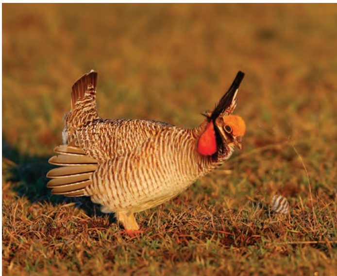
Lesser Prairie-Chicken.