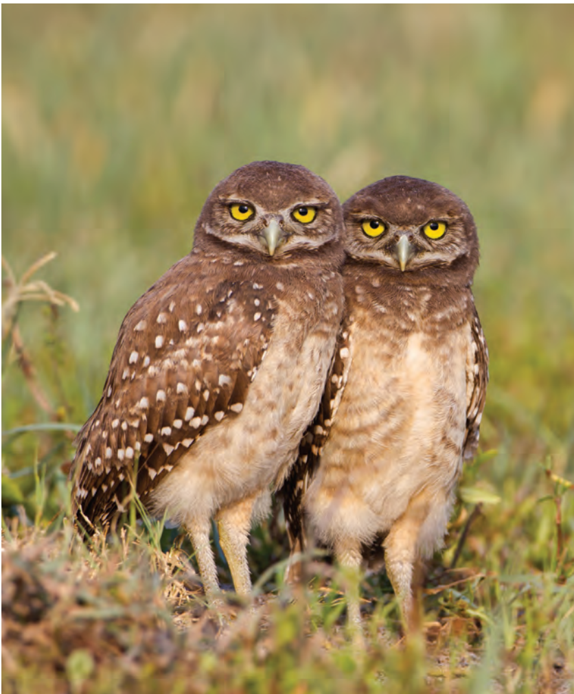
Burrowing Owls.