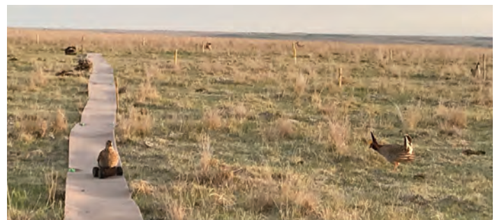
A male Lesser Prairie-Chicken courts a robotic female. The carpeting prevents the robot from getting caught in the grass.

I am excited to return to Kansas because when I am in a prairie, I feel more connected to nature than anywhere else. Kansas has so much wildlife to inspire us: male Prairie-Chickens dancing to catch a female's eye, cranes migrating overhead by the hundreds, flocks of Swainson's Hawks swirling around the smoke of a dying prairie fire looking for an easy meal, the first call in the spring of an Upland Sandpiper or Common Poorwill, and the list goes on . . . Besides wildlife, the picturesque sunsets, the dark sky, and the waves of blowing native grass are as calming as a spring thunderstorm is thrilling.