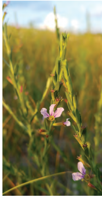
Verbena Dakota Mount Mitchell and Lythrum alatum Winged Loosestrife.