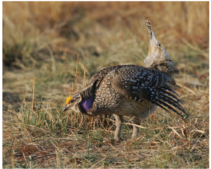
Sharp-tailed Grouse.