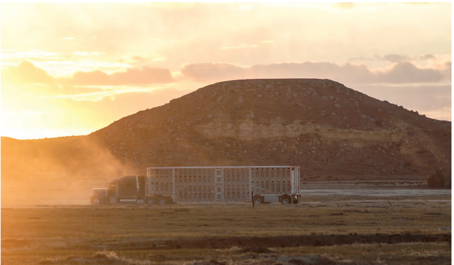
Cattle truck bringing steers to the Haverfield working ranch..