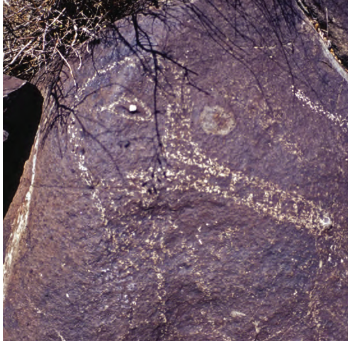
Crane portrait, petroglyph at Three Rivers, New Mexico.

loaded the possessions he had brought, hitched up and headed out to the homestead, 25 miles away.