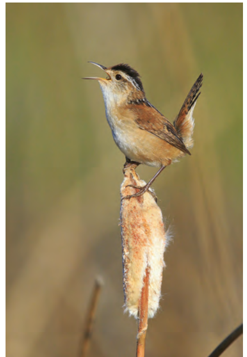
Marsh Wren.