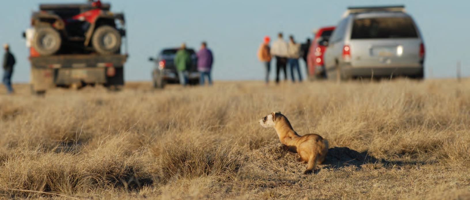
BFF release - people & vehicles

That is why, on behalf of Audubon of Kansas, I have been advocating for several years within the Kansas State Technical Committee (STC)—which advises the USDA’s Natural Resources Conservation Service and Farm Service Agency on conservation programs authorized by the federal Farm Bill—that conservation and management to benefit imperiled species, including Black-footed Ferrets, should be authorized. Congress specified that 10 percent of the annual allocations for the Environmental Quality Incentive Program (EQIP) to states should be available for Wildlife Resource Concerns. If that Congressional directive were implemented in Kansas, approximately $3 million of the $33 million allocated for this state could have been devoted to wildlife habitat enhancement, establishment and management just during the 2020 fiscal year. In addition to developing new, and much needed, wildlife habitat initiatives of potential interest to landowners, we all need to help advertise the existing opportunities available through the EQIP.