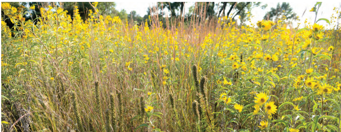
Pollinator habitat on Achterberg Farm

this original trail to possibly be extended on the south side of Bullfoot Creek, likely along but possibly over Horse Creek—if we find funding for a footbridge over that stream. Grant funding opportunities for this purpose, for surfacing, and for more signage and educational information will be pursued.