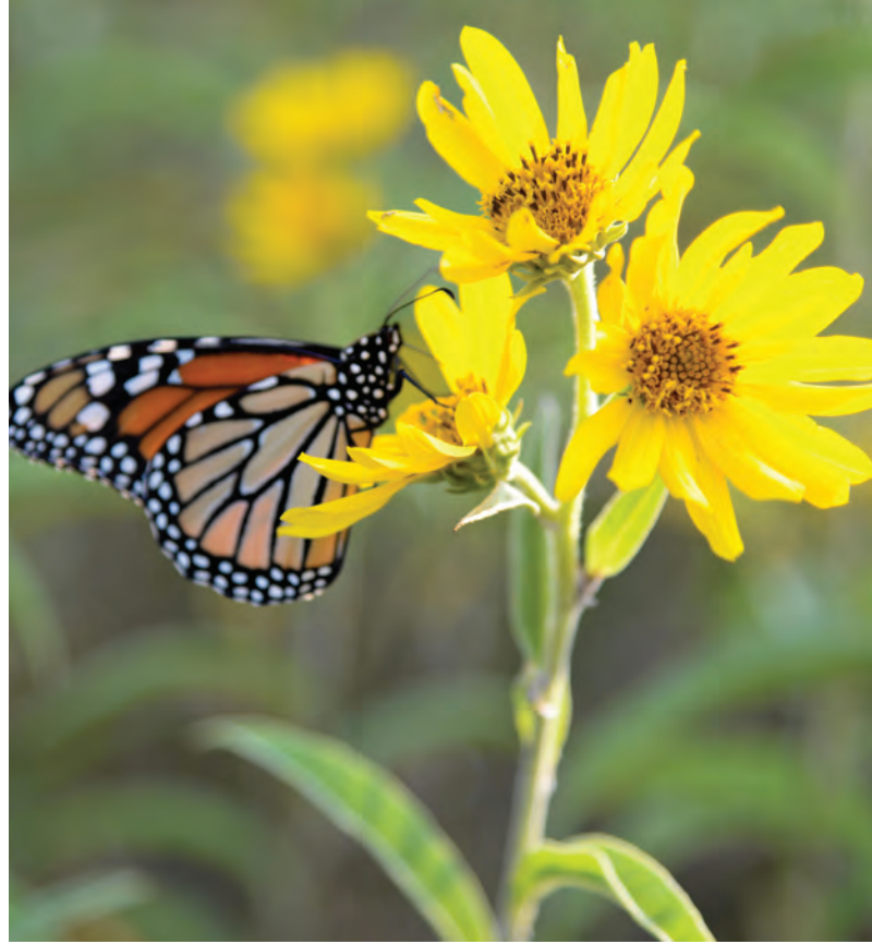
Monarch on Maximilian Sunflower in Pollinator habitat