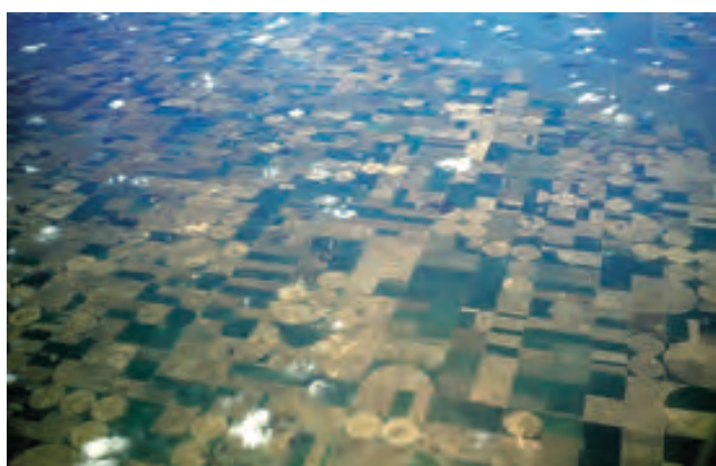
Center-pivot irrigation depleting Ogallala aquifer.

An area that received even less attention was reduced streamflow in many of the state's rivers and streams in western Kansas. The Arkansas River has generally been dry across much of western Kansas, from about Garden City to Great Bend, since the 1980s. Other smaller streams out west have also begun to experience drastically reduced flow, with an attendant impact on vegetation and wildlife that depends on that water. Tributaries of the Smoky Hill and the Republican River, for example, have seen substantially reduced flow.