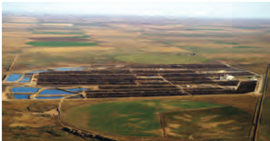
Cattle feedlot and waste water lagoon, courtesy of Kansas Geological Survey, Bill Johnson, photographer.

environmental and economic benefits through voluntary partnerships. With the use of ten-year contracts, CRP restores wetlands, provides natural habitat for wildlife, protects streams and removes carbon dioxide from the air. Because of federal budget cuts, CRP has been downsized nationally from thirty-five million acres to 23.5 million acres, with only 7.3 million of this acreage now in continuous CRP sign up for conservation practices. The Conservation Reserve Enhancement Program (CREP) accounts for 1.1 million acres through 47 agreements in 33 states. Kansas has just over two million CRP acres.