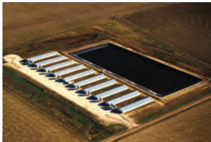
Confined feeding operation and waste lagoon