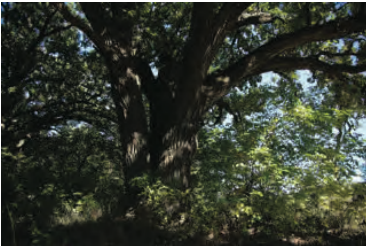
Massive Bur Oak on Haden property.