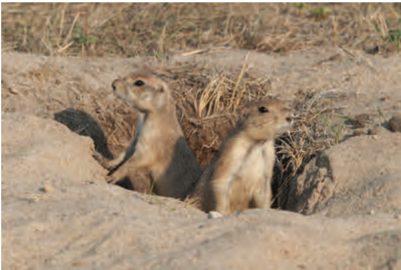
Two juvenile prairie dogs cautiously peer from their burrow at the Niobrara Sanctuary.

Prairie Wings is a publication of Audubon of Kansas, Inc. — the only widely distributed magazine devoted specifically to statewide conservation and wildlife advocacy initiatives. It is made possible by your generous support and contributions. We encourage you to share this publication with friends, family, and other organizations. Please feel free to leave copies in reception areas, hospitals and other business locations to help spread awareness about critical wildlife issues.