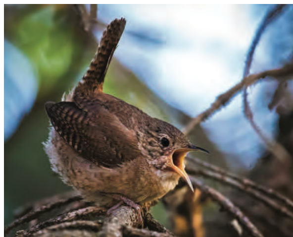
House Wren near the porch at the Lazy Easy Guesthouse.

Visitation to the sanctuary is limited to groups or individuals who have made reservations for one of the guesthouses or been granted permission to enjoy the sanctuary without lodging. Local zoning regulations do not provide for “public access,” and our foremost objective is to provide an exceptional sanctuary for wildlife. Donations from guests and others make it possible for AOK to provide the range of opportunities for appreciation of the natural world within the sanctuary. Persons interested in staying at one of the guesthouses or visiting the sanctuary are encouraged to contact the AOK office. The email address is aok@audubonofkansas.org , office phone is 785-5374-4385 and mailing address is 210 Southwind Place, Manhattan KS 66503.