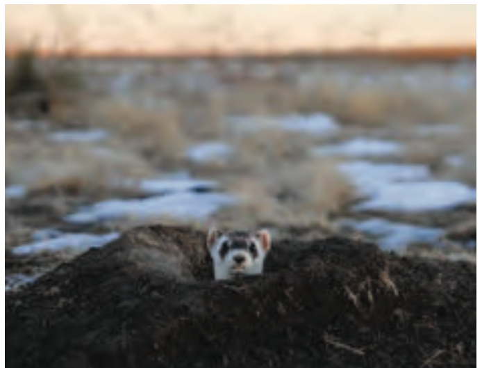
One of the first Black-footed Ferrets reintroduced in Kansas peers out of a burrow a few minutes after being released.

ten years — to protect the natural integrity of their land and the wildlife that depend upon it. One of the first major gifts of optimism came a week before Christmas in December 2007. The U.S. Fish and Wildlife Service reintroduced fourteen captive-bred Black-footed Ferrets (BFF) to this ranch complex just prior to sunset that evening. The descendants of those ferrets, and others brought in since that first reintroduction in Kansas, remain the only BFFs occupying their ancestral homeland on the short