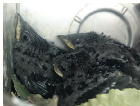
Intimate views of Martin home life: eggs and nestlings at two stages of development.