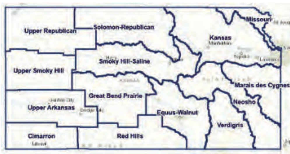
Illustration of the fourteen Regional Advisory Committees' territories, from the Kansas Water Office's website: kwo.ks.gov

called attention to the importance of preventing siltation in the first place. Given the scale of the issue and the substantial cost of dredging all of the reservoirs that need it, there is renewed emphasis on streambank stabilization to keep silt out of the reservoirs, though those remedies are costly as well, and their impact not completely understood.