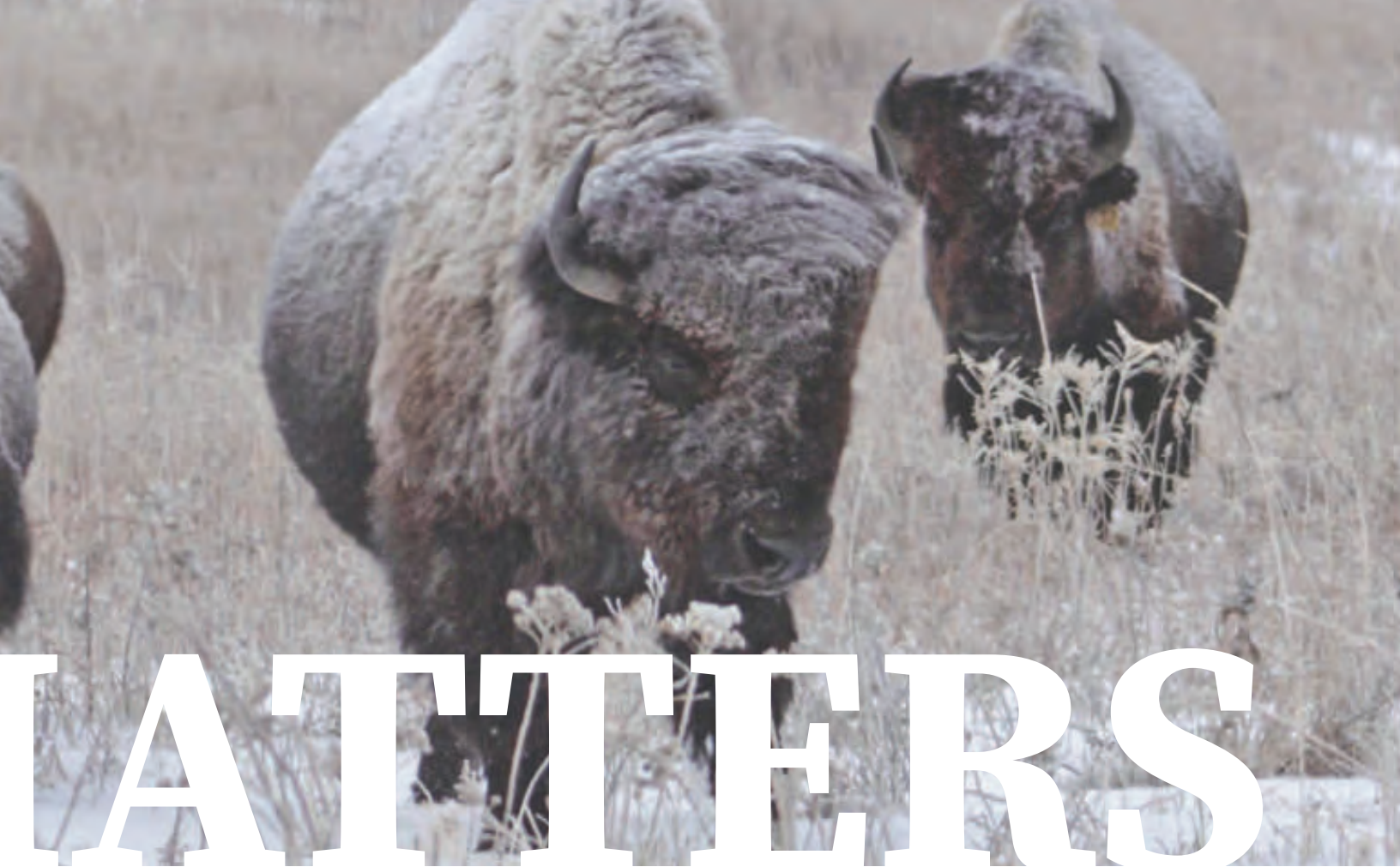
Bison in Snow.

The politicians, entrepreneurs, land developers, railroad men, hunters, farmers, entertainers such as “Buffalo” Bill Cody, all of whom were engaged in the intentional extermination of bison from North American prairies, were oblivious to the interrelationships among living beings on the prairie, with the health of one depending on the health of all. They were oblivious from the early years of the nineteenth century through 1885, by which time they had reduced the fifty million or more bison inhabiting the continent to eighty-three, thereby forcing Native People, whose communities needed bison for bodily and cultural sustenance, onto reservations. In 1851, Herman Melville, writing Moby-Dick and concerned about the extinction of whales in the continent’s oceans, anxiously compared whales to bison; “Consider the humped herds of whales with the humped herds of buffalo, which, not forty years ago, overspread by tens of thousands the prairies of Illinois and Missouri, and shook their iron manes and scowled with their thunder-clotted brows upon the sites of populous river-capitals, where now the polite broker sells you land at a dollar an inch; in such a comparison an