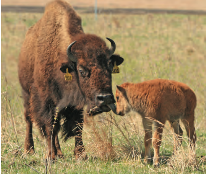
Cow and Calf.

enjoying the sport, the prairie habitat is also changed. Dampness is generated, and the bison wallow becomes a moist, mini-wetland with its own diverse species, including tadpoles, fairy shrimp, and chorus frogs. And when a bison dies (males live from ten to twelve years, cows to eighteen), like a whale fall, the bison body remains where it collapses, returning all of its nutrients to prairie earth.