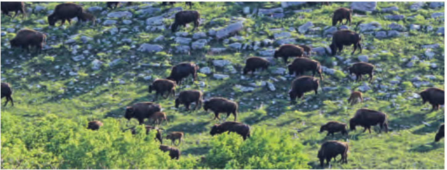
Bison on Konza.