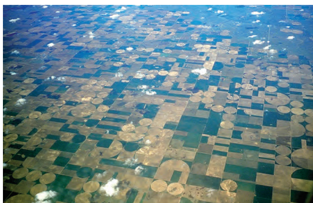
Center-pivot irrigation depleting Ogallala aquifer.

An area that received even less attention was reduced streamflow in many of the state's rivers and streams in western Kansas. The Arkansas River has generally been dry across much of western Kansas, from about Garden City to Great Bend, since the 1980s. Other smaller streams out west have also begun to experience drastically reduced flow, with an attendant impact on vegetation and wildlife that depends on that water. Tributaries of the Smoky Hill and the Republican River, for example, have seen substantially reduced flow.