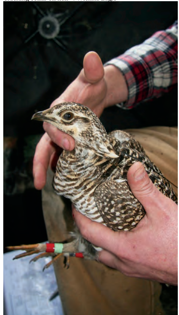
Tracking collar on hen

with mouths full of mostly dead grass. Thus, these areas are grazed continuously, and through the years they transition to the least-desirable plant communities while other areas are seldom utilized.