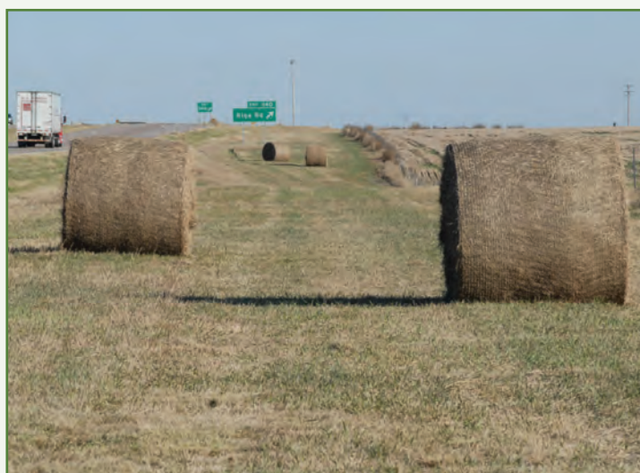
Private haying and removal of contaminated hay from highway roadsides has become a vector for spreading of OWB.