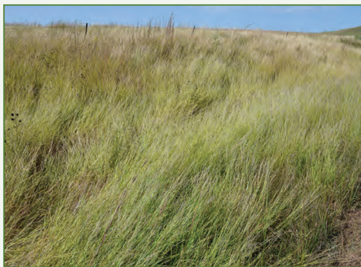
Top photo, a May view of an OWB-infested roadside following a spring burn, showing bare areas between clumps--and erosion. Lower photo, the same roadside in September illustrating the dominance of OWB--and the near total elimination of native plants.