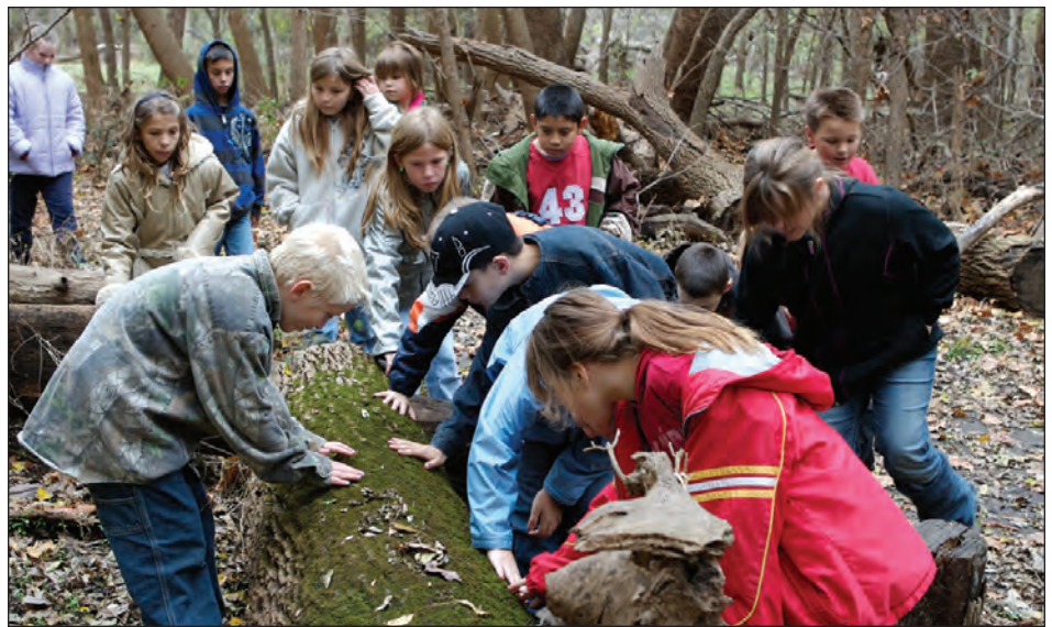
A class from Arkansas City examines life on a fallen log. Bottom photos on opposite page: A Big Brothers Big Sisters group on an outing to CNC. The bluff staircase leads from the Visitor's Center to the trails to the Arkansas River.