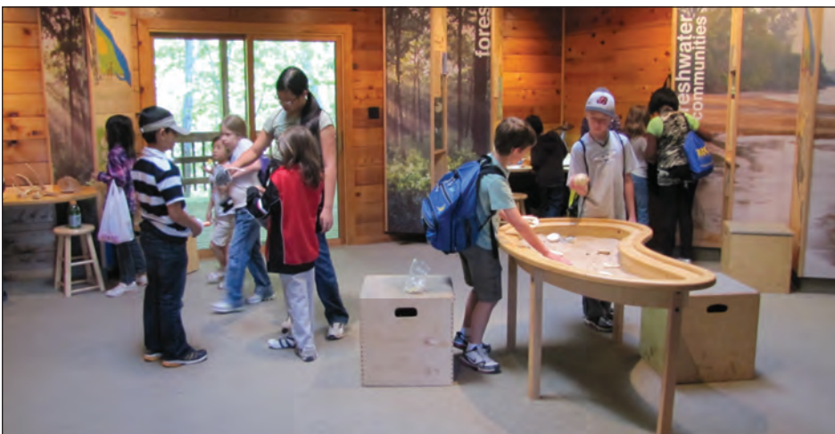
A class of students from Wichita explores the new exhibits in the Visitors Center.

Check out the full schedule at wichitaaudubon.org and plan a visit soon!