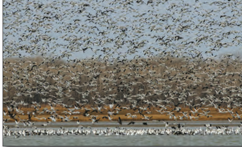
Snow Geese, November.