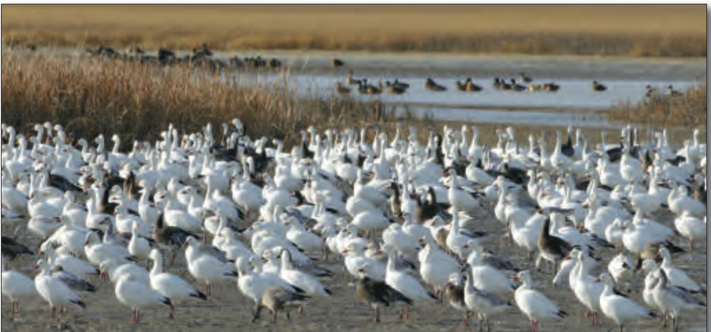
Snow Geese, November.

Our nation's general funds also pay for USDA, USACE and USBOR programs—including the acquisition and most of the management of the hundreds of thousands of acres administered by those agencies in Kansas. Another major program financed by all taxpayers is for contracts involving all of the 2.3 million acres