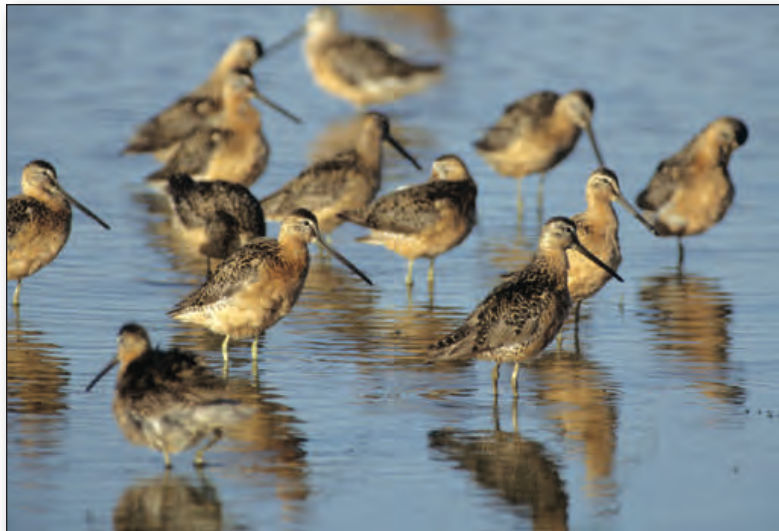
Long-billed Dowitchers, migration.

The best-known and most-consistent nesting colony of Black Rails in the state of Kansas is in a flooded meadow within the Quivira NWR; however, it only accommodates a few birds. Preferred nesting sites appear to be marshy areas with stable water levels. That is a feature not common at most Kansas wetlands.