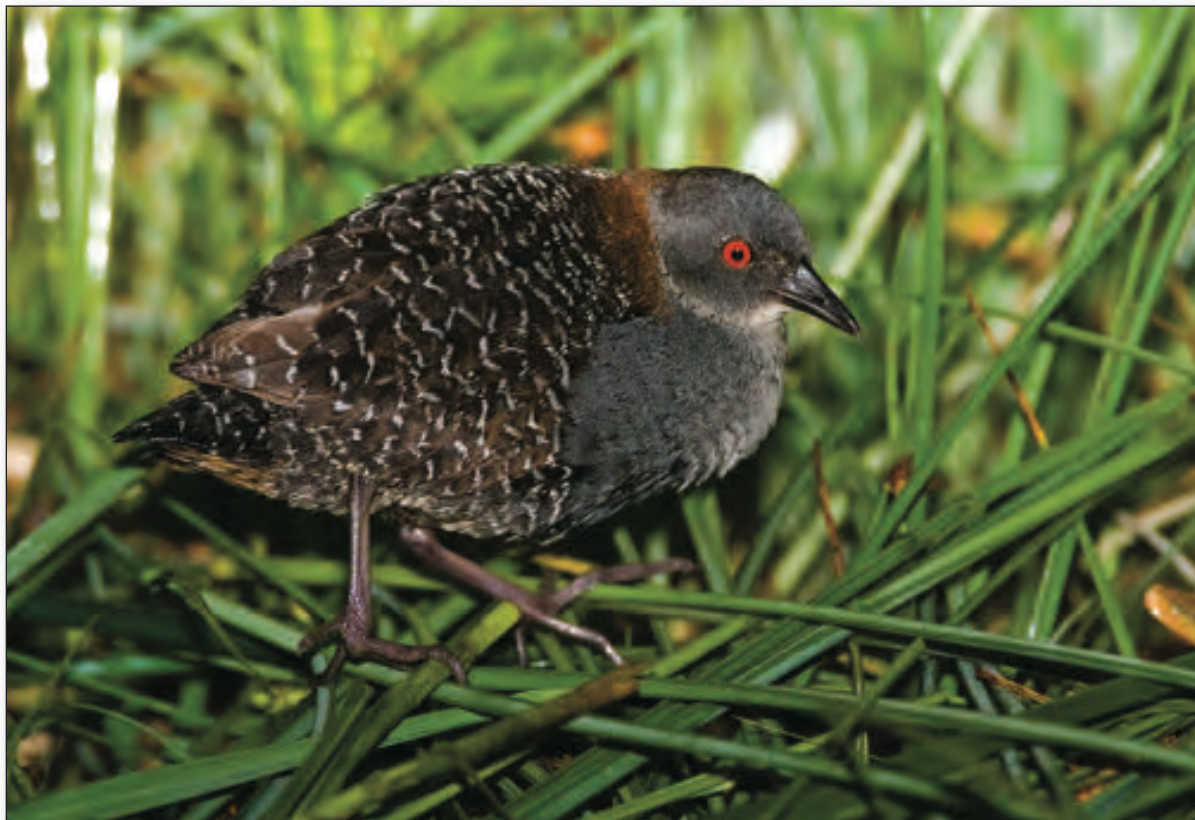
Black Rail, May.

Black rail populations have been declining in the eastern United States for over a century, resulting in a retraction of its breeding range, an overall reduction in the number of breeding locations within its core range, and a loss of individuals within historic strongholds. Over the past 10 to 20 years, some reports indicate that populations have declined 75% or more and have become dangerously low.