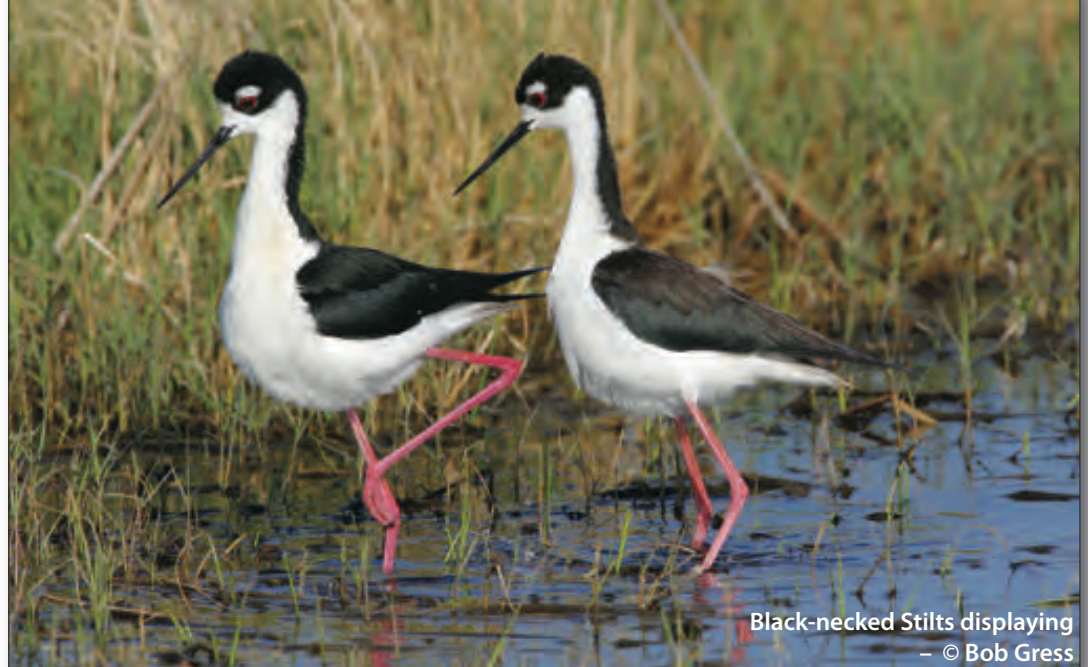
Black-necked Stilts displaying