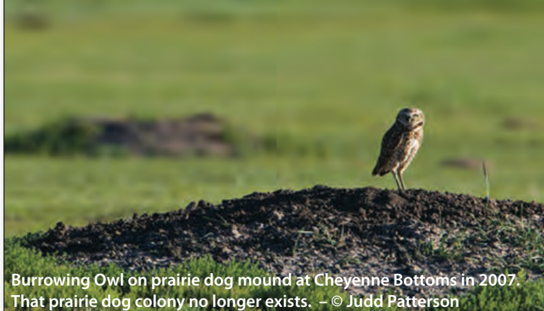
Burrowing Owl on prairie dog mound at Cheyenne Bottoms in 2007. That prairie dog colony no longer exists.

It is important for USFWS to recognize that the Quivira NWR presents an opportunity to establish a prairie dog colony complex of regional significance that goes far beyond that envisioned in the