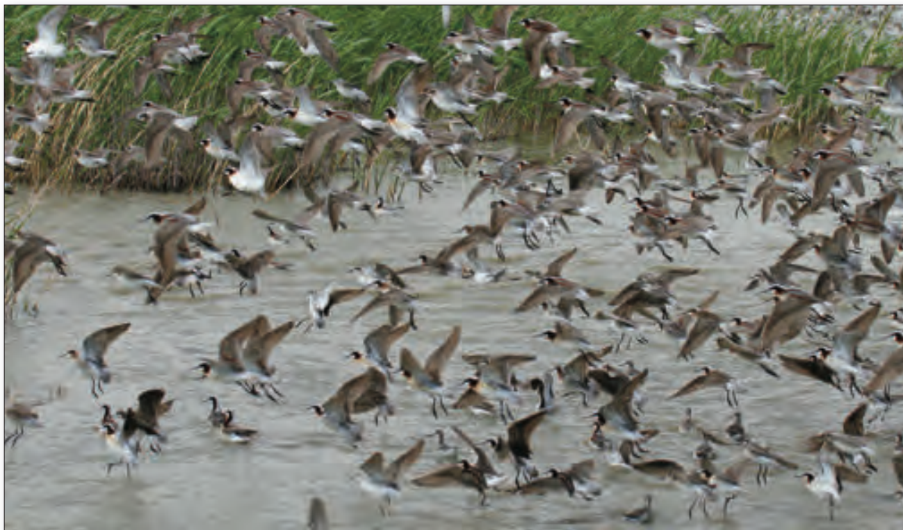
Wilson's Phalaropes, spring migration.

It has become “the place” for wildlife enthusiasts to visit because of the management of this unique wetland and sand-prairie complex. It has a sufficient, but limited, system of roads that are not excessively intrusive. In the past the refuge has been closed to hunting when Whooping Cranes are present and somewhat restricted at other times. That enhances the appeal for autumn visitation because it is one of the few wildlife areas