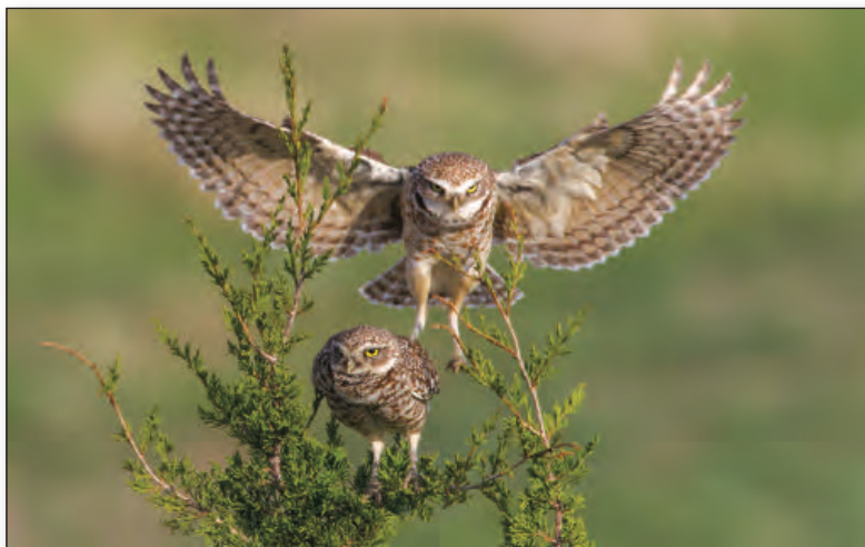
Burrowing Owls. Norton County.

If Audubon of Kansas’ recommendations are adopted by the USFWS for the Comprehensive Conservation Plan and Environmental Assessment , we envision the future of the Quivira NWR as a refuge of continuing and increasing importance for Whooping Cranes, and numerous other wetland as well as grassland Species in Need of Conservation , possibly including a site contributing to the recovery of Black-footed Ferrets.