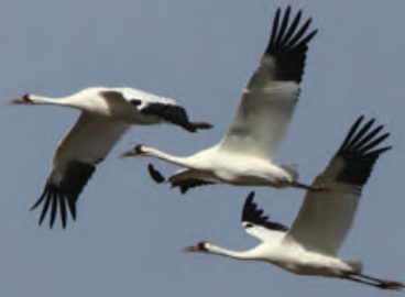
Whooping Cranes, November.