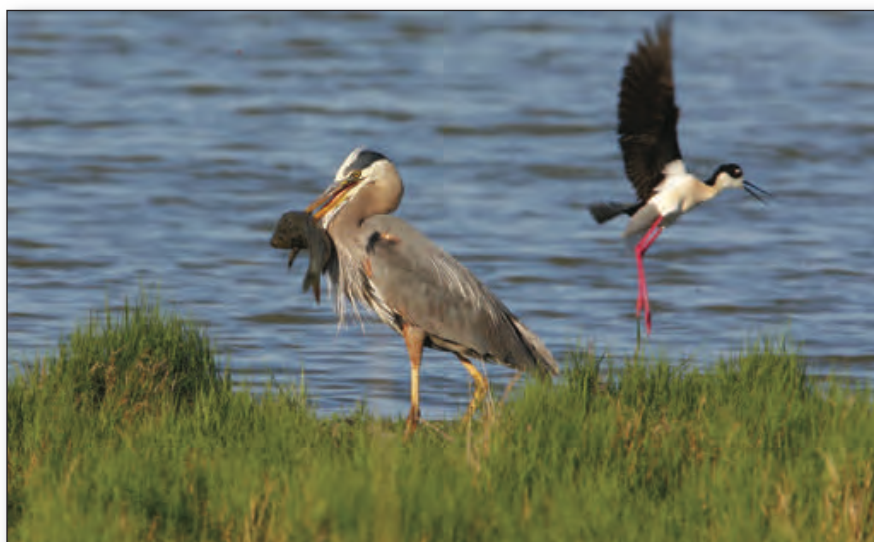
Great Blue Heron with Carp. Black-necked Stilt flying.

Likewise, Snipe and Woodcock (uncommon and rare at the refuge) are not always easily distinguished from Dowitchers and an array of other shorebirds. While Snipe hunting with a state waterfowl biologist, I saw him mistakenly shoot a solitary sandpiper. This happens – usually unintentionally. But there is no reason to have it occur within the critically important migratory shorebird habitat within Quivira. The disturbance of all the wetland birds present is likely a more significant factor.