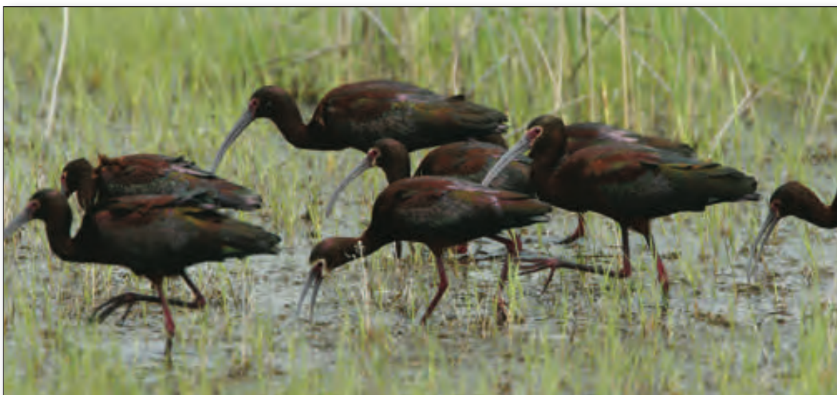
White-faced Ibises, May.