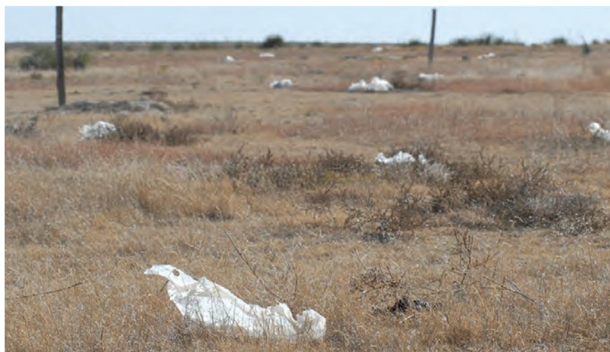
Plastic bags partially filled with sand cover prairie dog burrows across hundreds of acres, littering the landscape with plastic above ground and serving as burial markers for all that lived in the burrows at the time of the application of Phostoxin--a poisonous gas.

morning, I obtained a temporary restraining order prohibiting further use of the fumigant without a hearing on the legality of the use. Officials with the Kansas Department of Wildlife and Parks quickly disclaimed any interest in the fight and left the matter up to the County to defend.