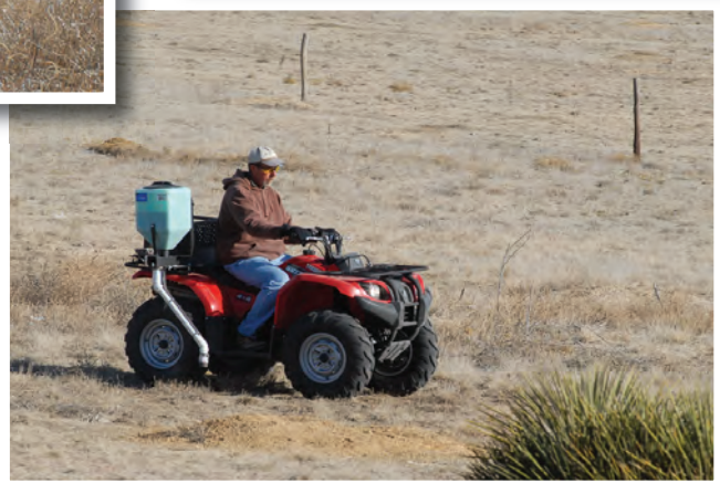
In an area still littered with plastic bags from the Phostoxin application, a few months later a County employee applies Rozol Prairie Dog Bait to every open burrow he can find within the buffer area surrounding and within the Haverfield Ranch complex.

Kansas Farm Bureau's attorney and the anti-prairie dog entourage he had assembled. Not one word of this conduct was mentioned by the County. The hypocrisy of this was astounding: the County argued that it needed injunctive relief and yet days before the hearing their hired exterminator came onto the ranch complex and poisoned 500 acres of prairie dog colonies