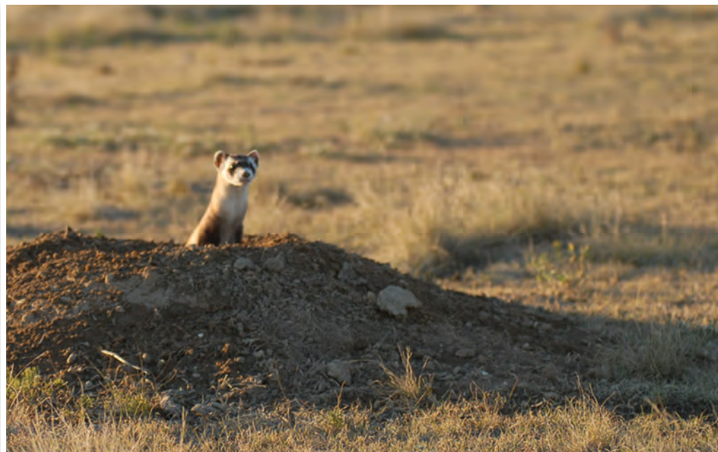
Following release, a captive-raised Black-footed Ferret surveys its new home from atop a prairie dog mound on property owned by Maxine Blank..

Although the Logan County Commissioners and allied politicians have railed that prairie dogs are emigrating from the properties and boundary controls have not been successful, the data maintained by the field staff of USDA’s Animal and Plant Health Inspection Service’s Wildlife Services division (APHIS-WS) demonstrate the opposite. As an illustration of this fact, 105,740 prairie dog burrows were treated with toxicants on neighboring properties in the 2009-2010 season. The number of active burrows dramatically declined each year and by 2012-2013 the reduced number treated totaled 40,211. Likewise, the number of prairie dogs killed with firearms dropped from 8033 in 2011 to 5073 in 2013. Following an Audubon of