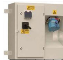
Norm connection plug

Please note: A stable electric power supply meeting above specifications must be warranted for the whole rental. Cable protective ramps or catenary systems shall be provided by the Client where cables traverses roads or pathways.