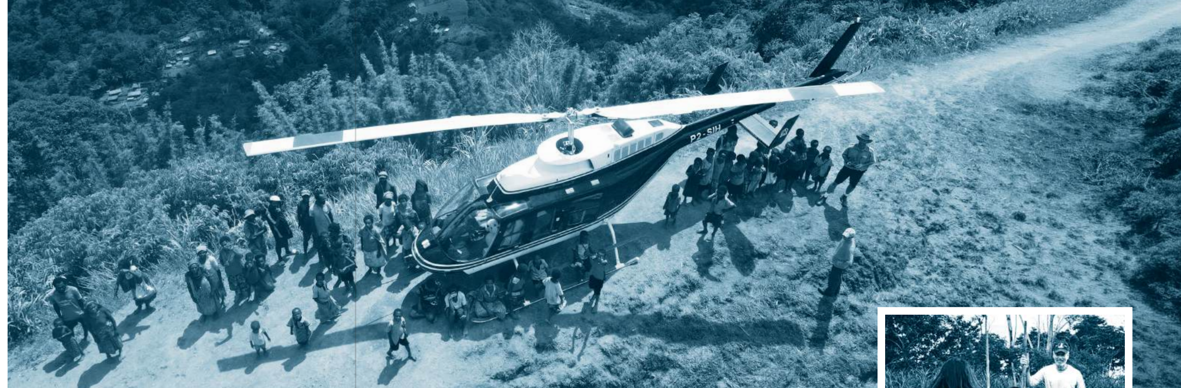
One of our pilots perched along a mountain range, right next to a sharp drop-off in Guningwa, Papua New Guinea.