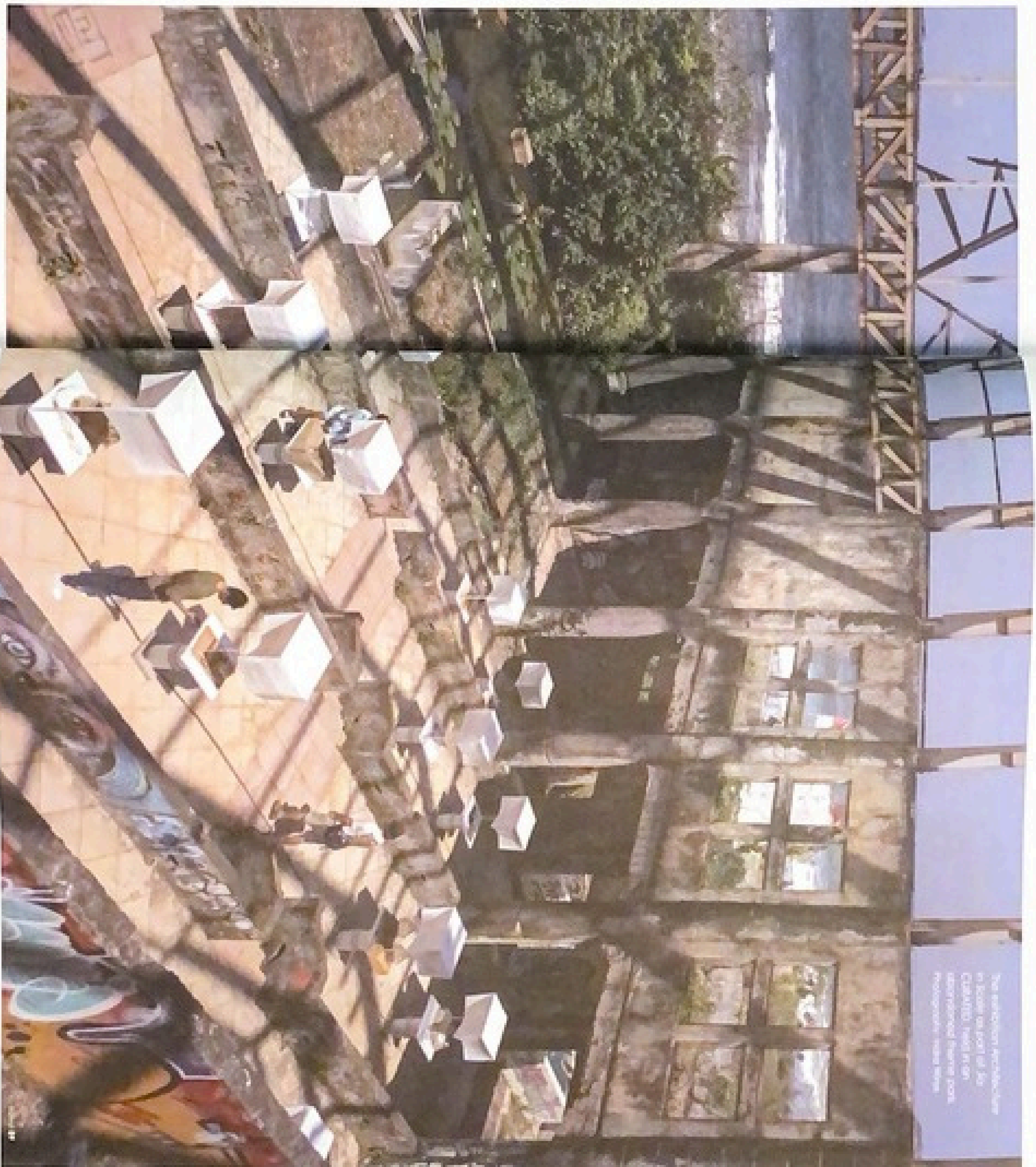
The temporary architecture in Soeska was built by the CIBARDIO team in an abandoned theme park.