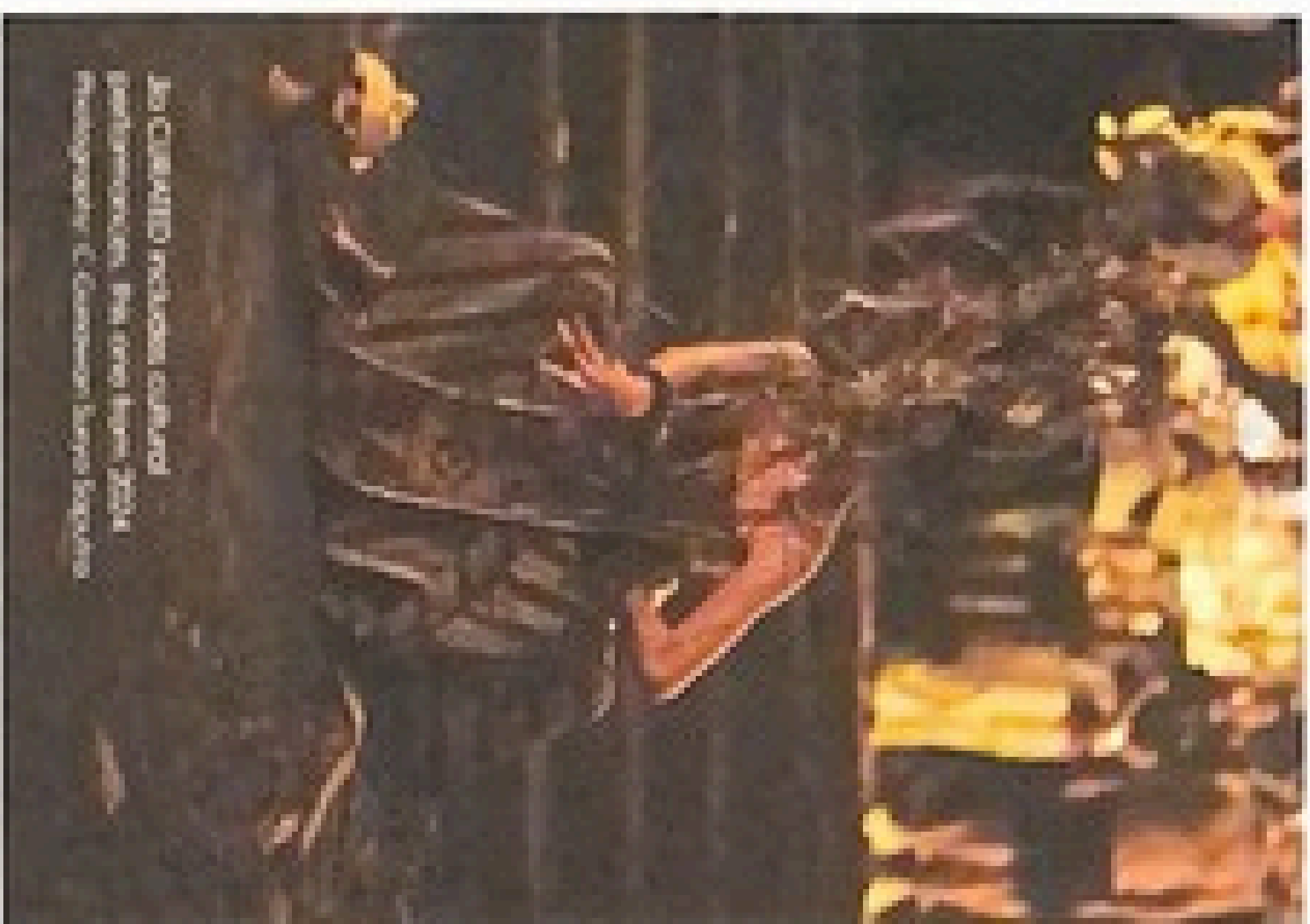
As CIBARDIO includes outdoor performances, the new park, 2024