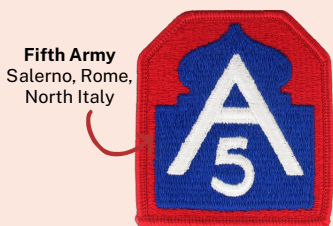
Fifth Army Salerno, Rome, North Italy

The Nisei soldiers gained many patches for their campaigns during World War II. Here are some!