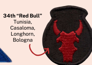
34th “Red Bull” Tunisia, Casaloma, Longhorn, Bologna