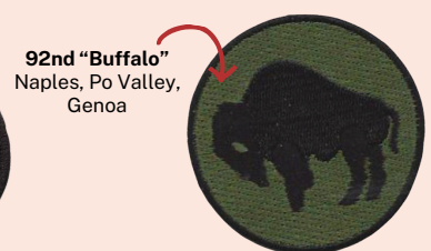
92nd “Buffalo” Naples, Po Valley, Genoa