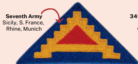
Seventh Army Sicily, S. France, Rhine, Munich