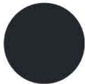
Silver Sand Black