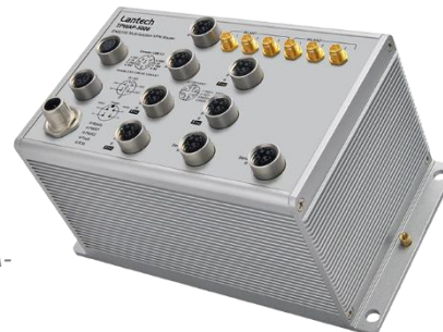
With 2 serial ports