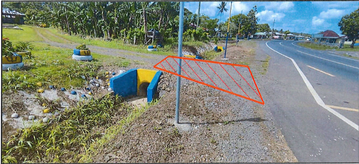
Figure 1: One of the driveways situated within Lot 1B proposed to be resealed