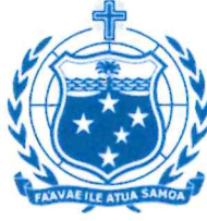
Samoa Maximum Retail Price Mar 2025-- Feb 2026