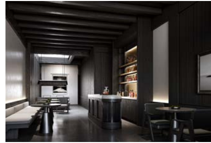
Dining & Bar