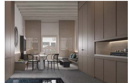
Three-Bedroom Suite Size—188m 2 / 2,024 sq. ft. Available in June 2026