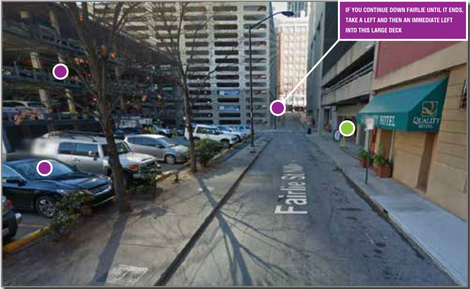
STREET VIEW OF EQUITABLE PARKING DECK ENTRANCE