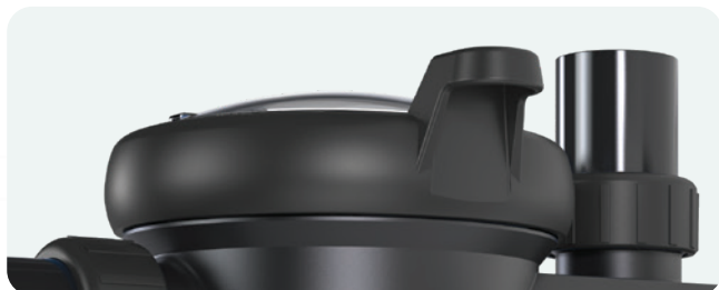
Ergonomic Handle & Lid

Noise reduction design and optimised water flow delivers optimal performance. The Zenflow ZF Series pump is designed for easy and hassle-free installation. The newly designed base makes the pump suitable for retrofitting into existing pool systems, providing an upgrade option for pool owners.