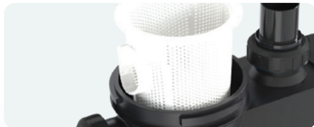
Enlarged 3L Strainer Basket