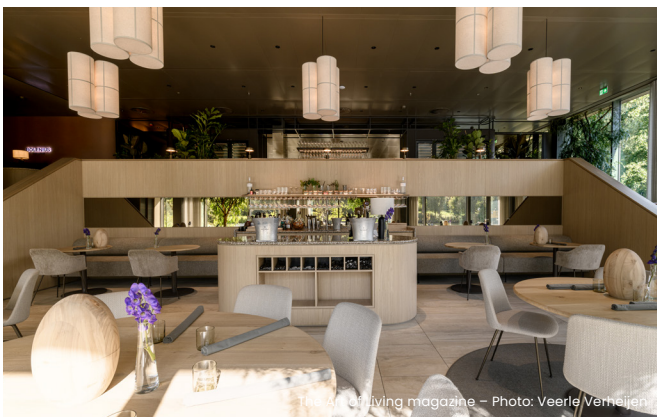
Living magazine

High-end cuisine, great wines, nature ...and shared memories