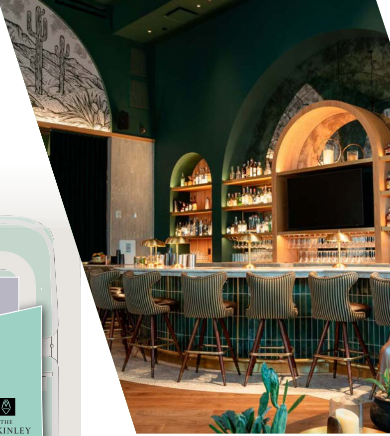
Credence, a MICHELIN recommended restaurant