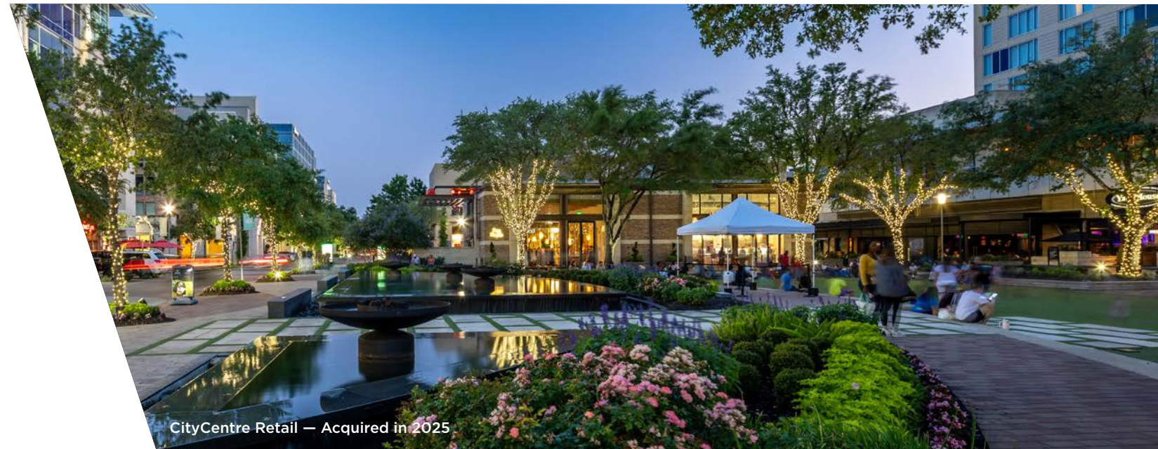
CityCentre Retail — Acquired in 2025