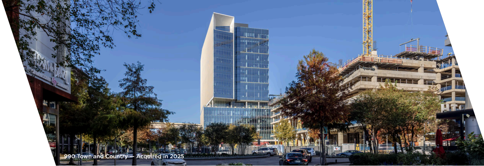
990 Town and Country — Acquired in 2025

As a family-owned, privately held company, MetroNational stays focused on what matters most: the long-term success of Memorial City and our West Houston developments. For over 70 years, we've lived, worked, and invested here, which allows us to make independent decisions and provide the stability you can count on for years to come.