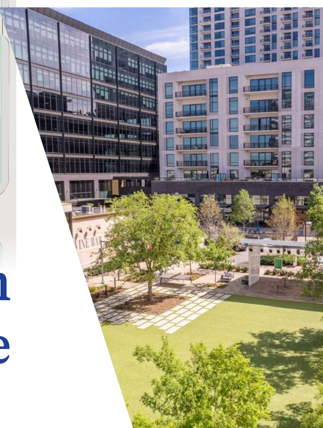
The Lawn at Memorial City is an event, concert, and festival greenspace located next to Hotel ZaZa