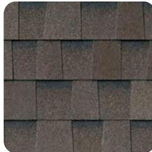
Weathered Wood - Shown on cover