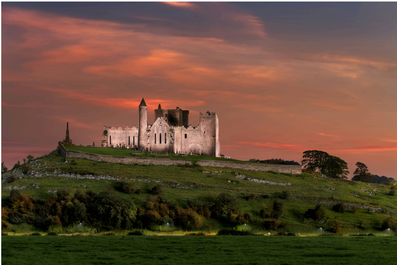
Rock of Cashel, Cashel, County Tipperary, Ireland