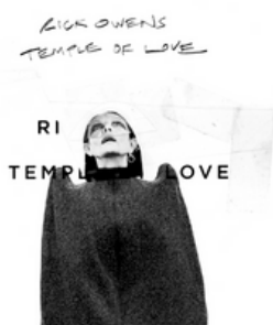
RICK OWENS, TEMPLE OF LOVE Palais Galliera