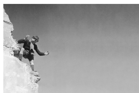
ROBERT DOISNEAU INSTANTS DONNÉS Musée Maillol