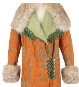
PAUL POIRET, LA MODE EST UNE FÊTE Musée des arts décoratifs