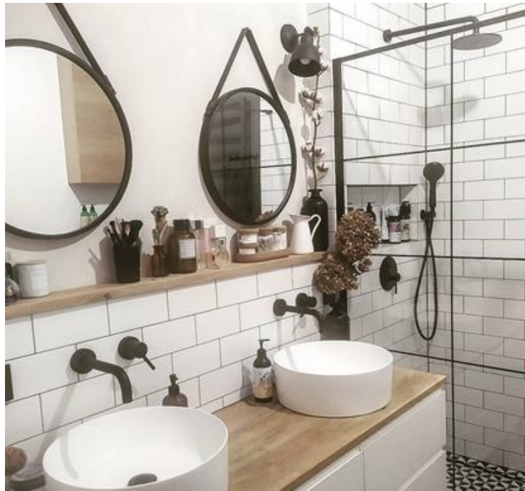
Figure 4 Installed product.