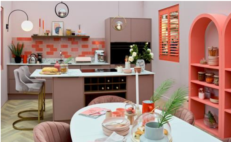
Figure 5 Installed product.

The environmental burdens and benefits of obtaining secondary material from waste generated at the manufacturing stage (waste such as cardboard, plastic and wood), at the installation stage (product losses, tile packaging waste: cardboard, plastic and wood) and at the end of life of the product have been considered.