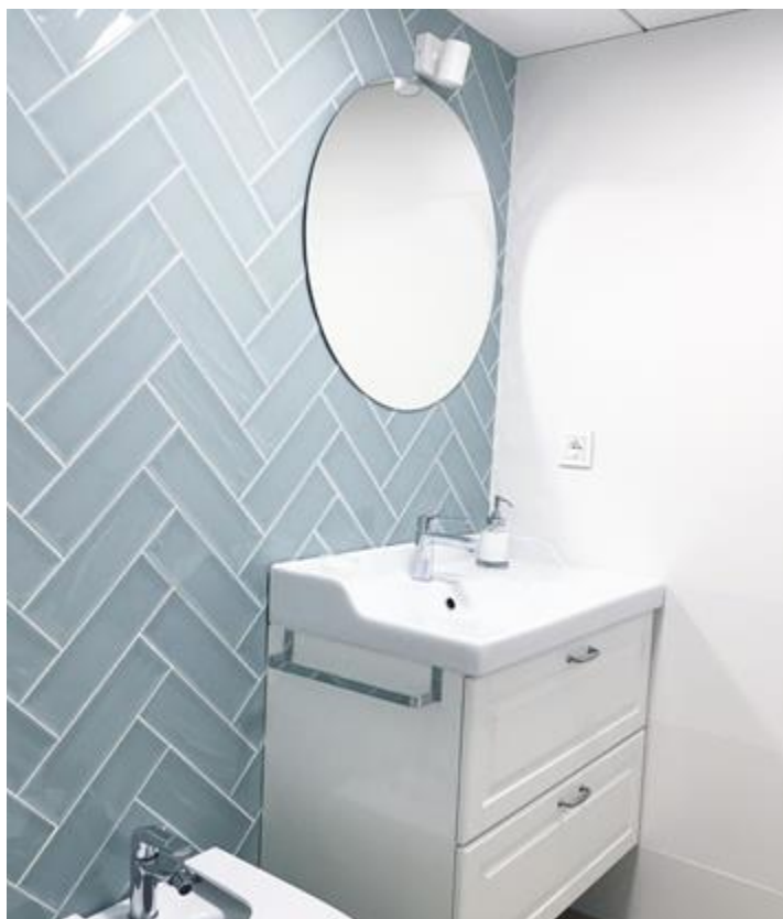
Figure 1 Installed product.

The product features are included in the technical datasheets which can be requested from the manufacturer, being them, the ones required by the EN 14411:2016 standard.