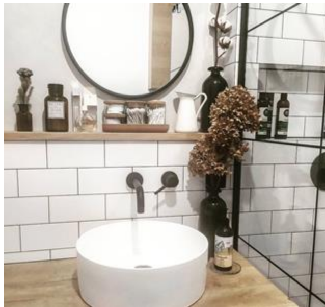
Figure 2 Installed product.

The Life Cycle Assessment (from now on LCA) has been carried out using GaBi 10.0.0.71 [5] software and the data base version 2020.1. (SP40.0) [6] (SpheraSolutions). The characterization factors used are those included in EN 15804:2012+A1:2013 standard.