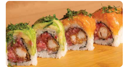
B.A.D & Boujee