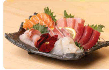
Deluxe Sashimi Platter おすすめ