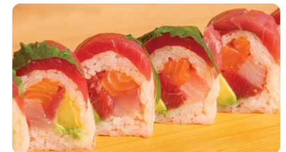
Fancy & Furious