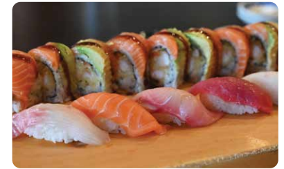
Supreme Combo 最高のコンボ