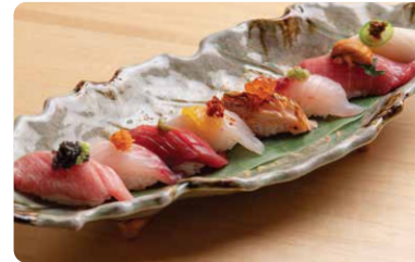
Opulent Nigiri Flights 甲冑カッチュウ