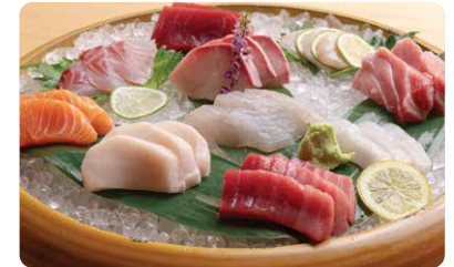
Premium Sashimi Platter 匠

Billy Sushi's Natural Bluefin Tuna is one the freshest and highest quality available. Experience Otoro (fatty tuna belly), a decadent, melt in your mouth pleasure, or Chutoro (medium fatty tuna belly) and Akami (lean tuna) in sushi or sashimi presentations. We offer Bluefin tuna year-around subject to weather and supply conditions. Please check our omakase menu for availability, Kampai