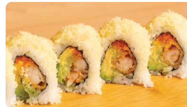
Crunchy (JJ Hill)