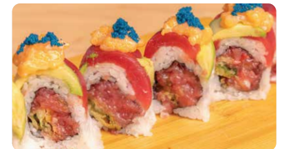
Big Blue Wave