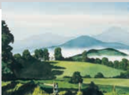
Mist in the Hills Available as a notecard & print