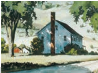
Farm House on a Country Road Available as a notecard