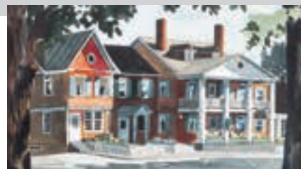
Green Mountain Inn in Summer Available as a notecard & print