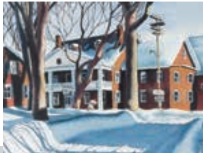
Green Mountain Inn in Winter Available as a notecard & print