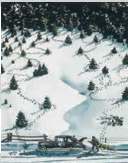
The Christmas Tree Available as a print