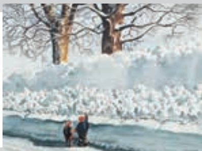
After the Snowfall Available as a notecard & print