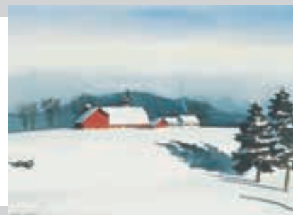
Snowy Morning in Elmore Available as a notecard & print