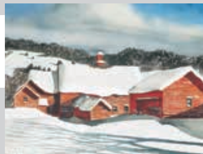
Stowe Hollow Barn Available as a print