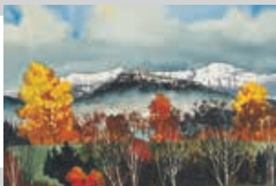
First Snow on Mt. Mansfield Available as a notecard & print