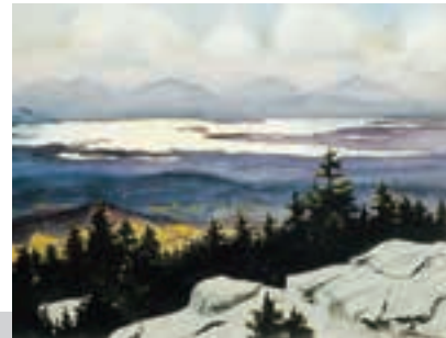
View of Lake Champlain from Mount Mansfield Available as a notecard & print