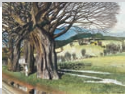
Vermont Backroads in April Available as a print