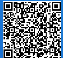
Register to Lunch & Learn