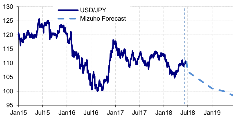
Fig. 4 CNH to stay steady in 2018

We expect the CNH to remain steady in H2, ranging between 6.2 and 6.6 level throughout the year (Fig. 4). Despite the downplay of growth target by Chinese leaders, China fundamentals remained fairly stable and the RMB market should be more resilient to USD rebound and global monetary tightening among EM currencies. The risk of China-US trade tensions should be contained as the trade war was being averted and a currency war for competitive currency depreciation was unlikely. Going onward, China is to stick with its plan for capital account liberalization and RMB internationalization. While capital outflow pressure in China was contained, capital inflow from global FX reserves diversification alongside the open-up of China onshore bond market will likely keep the CNH supportive. We expect PBoC to maintain its neutral and prudent monetary policy stance with higher flexibility in liquidity management, with the possibility of targeted Required Reserve Ratio (RRR) cut later this year. Hence, the RMB movement would depend more on global monetary tightening pace rather than the rigid China monetary policy stance.