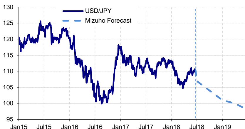
Fig. 2: We maintain our call of USD/JPY decline to 100 at year-end

We maintained our view that USD/JPY will gradually fall to 100 level (Fig. 2). For the USD side, the Fed may reach the peak of current rate hike cycle next year. In June, the Fed left its longer-term rate projection unchanged at 2.875%, which is regarded as Fed's target rate to achieve. This suggested limited room left for further rate hikes in coming years. We reckon that even two more rate hikes in H2 are not able to fuel upside momentum of USD/JPY. Moreover, concern over worsening US fiscal balance and Trump's weak USD policy implied by his protectionist stance could resurface and weigh on USD/JPY. The US mid-term election outcome will shed light on the outlook of Trump's presidency, and mounting political uncertainties boost safe-haven demand for JPY. For the JPY side, the possibility of ending Abenomics could fuel speculation of ending BoJ's aggressive monetary easing led by Abe's close allies of BoJ Governor Kuroda. The sliding popularity of PM Abe's Cabinet risks his leadership in Liberal Democratic Party (LDP) election in September. After all, it would be too early for the BoJ to begin QE exit this year as inflation remained well below 2% target. However, any speculation of BoJ's plan to exit QE and JPY's strong fundamentals should keep the JPY supported throughout the year.