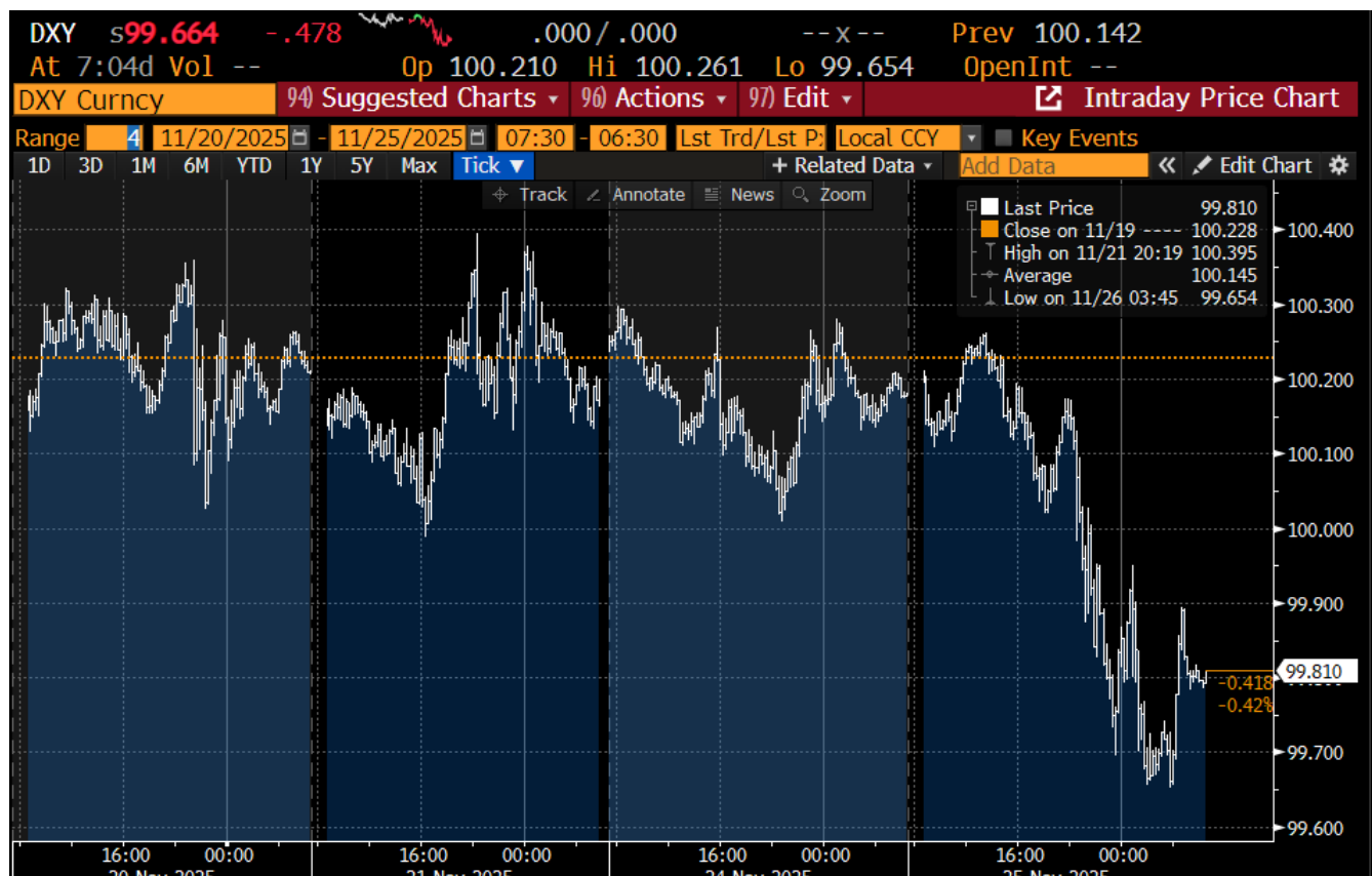
Exhibit 2: USD (proxied by DXY index) Drops ~0.5% Corresponding to Chair jumps to 55%

Link: Who will Trump nominate as Fed Chair? [2026] Odds & Predi... | Polymarket