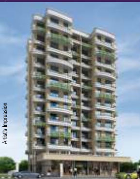
SAI SAHIL ULWE