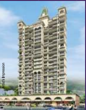
SAI MOKSH KHARGHAR