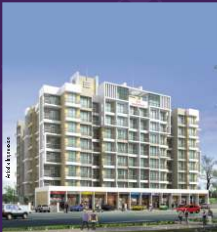
SAI HARMONY ULWE