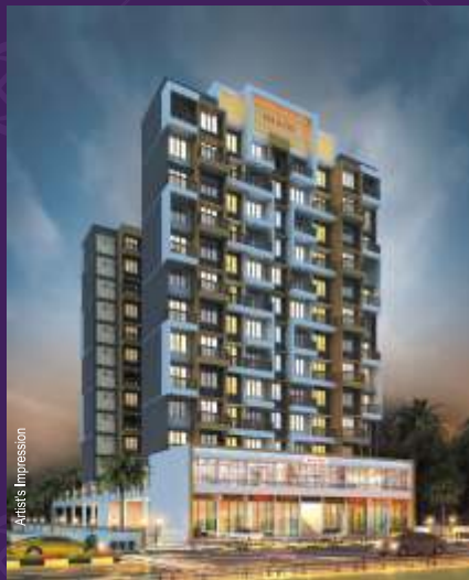
SAI ICON KHARGHAR