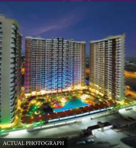
SAI MANNAT KHARGHAR