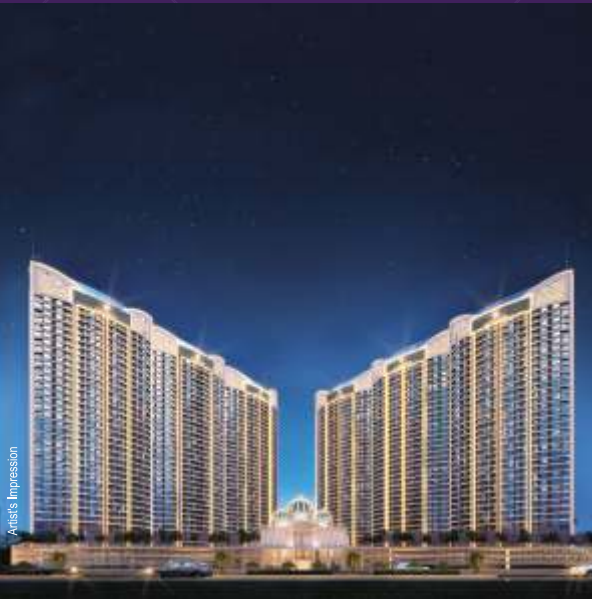
SAI WORLD EMPIRE KHARGHAR