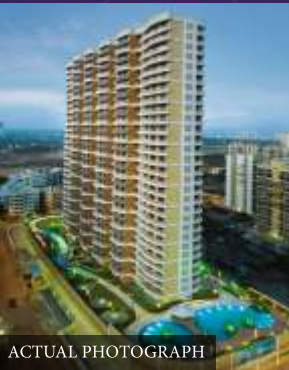
SAI CRYSTALS KHARGHAR