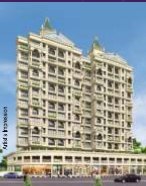
SAI FORTUNE ULWE