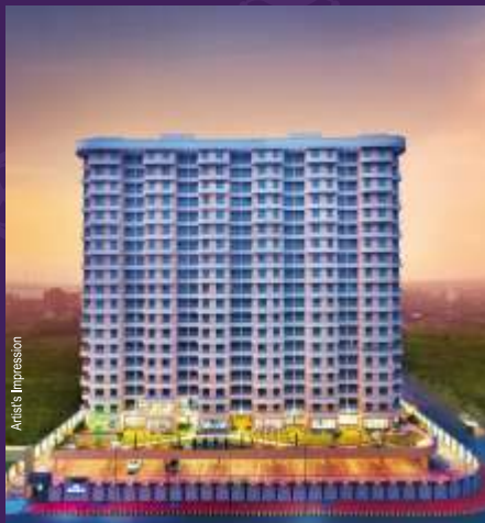
SAI RIVERDALE TALOJA