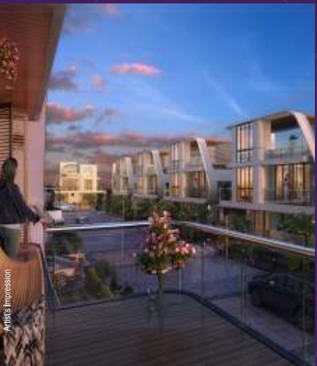
SAI WORLD RETREAT LONAVALA