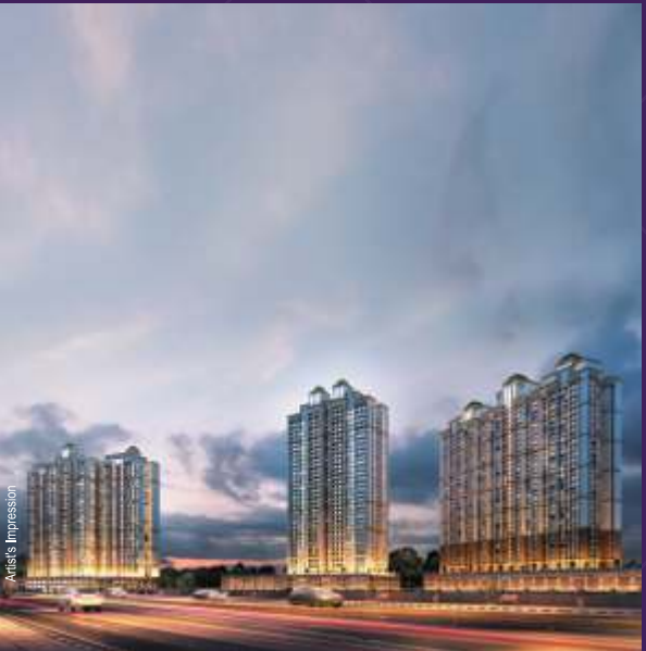
SAI WORLD CITY PANVEL