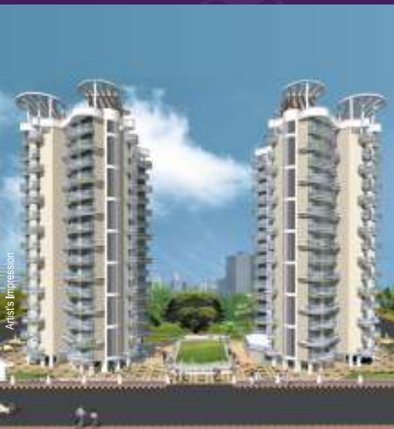
SAI PEARLS KHARGHAR