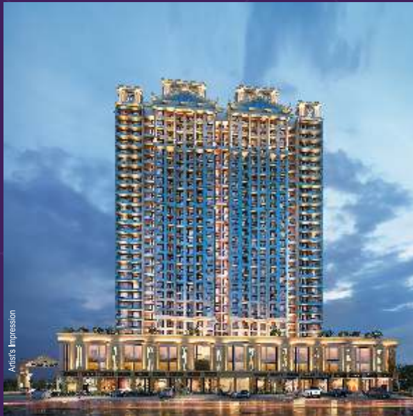
SAI WORLD LEGEND ULHASNAGAR