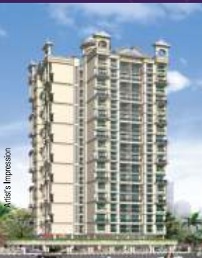
SAI JEWEL KHARGHAR