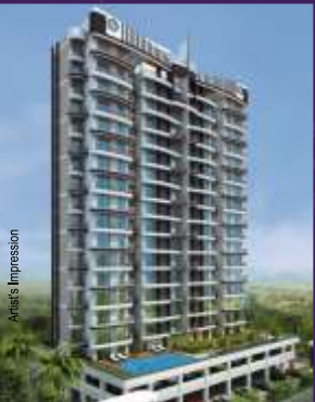
SAI WONDER KHARGHAR