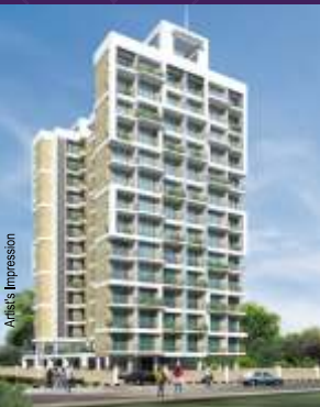
SAI GANGA ULWE