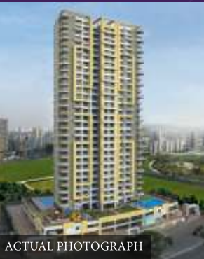
SAI SOLITAIRE KHARGHAR