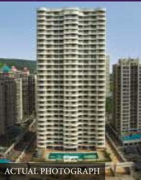
SAI SPRING KHARGHAR

LIFESTYLES THAT STAND AS ELOQUENT TESTIMONIALS TO PERFECTION