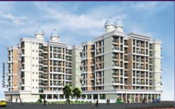
SAI SAPPHIRE ULWE