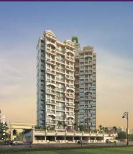
SAI SYMPHONY KHARGHAR