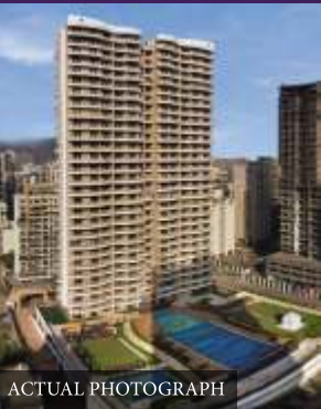
SAI MIRACLE KHARGHAR