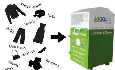
Textile recycling services provided by USAGain.