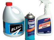
Household Cleaners and Chemicals