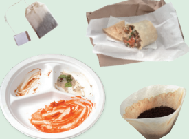
Food Soiled Paper