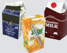
Waxed Drink Cartons & Beverage Boxes