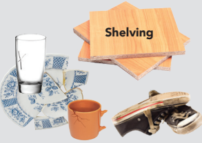
Miscellaneous Household Waste

KEEP THESE ITEMS OUT OF THE GARBAGE BIN.