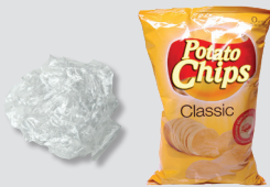
Plastic Bags & Wraps Retail shipping bags