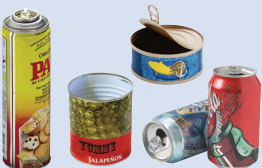
Aerosol & Metal Cans

KEEP THESE ITEMS OUT OF THE RECYCLE BIN.