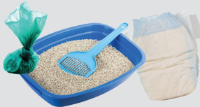
Diapers & Pet Waste Pet waste litter must be in a bag