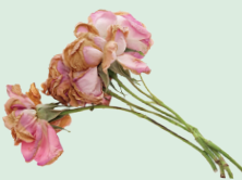
Flowers & Plant Debris