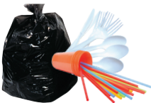
Plastic Bags & Utensils