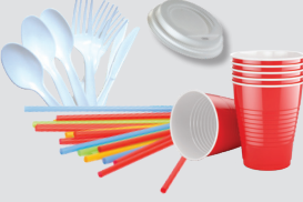
Plastic Utensils, Lids, & Straws