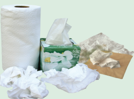
Paper Napkins, Towels & Tissues