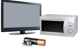
Hazardous Materials & E-Waste