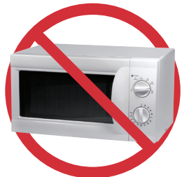
NO appliances or electronics/eWaste

DO NOT include hazardous or toxic wastes in any of the bins!