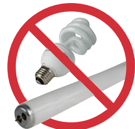
NO fluorescent tubes or CFL light bulbs

DO NOT include hazardous or toxic wastes in any of the bins!