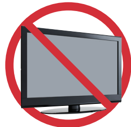
NO computers, monitors or TVs