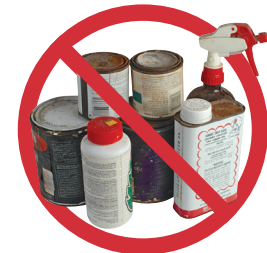
NO chemical cleaners, paints, solvents or other toxic chemicals