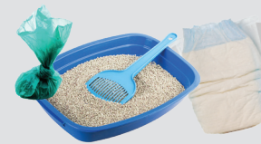
Diapers & Pet Waste Pet waste litter must be in a bag