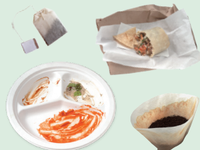
Food Soiled Paper