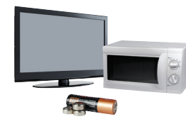
Hazardous Materials & E-Waste