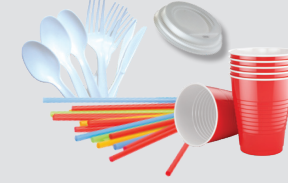
Plastic Utensils, Lids, & Straws