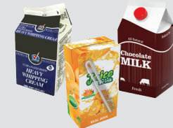
Waxed Drink Cartons & Beverage Boxes