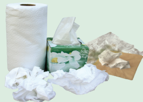
Paper Napkins, Towels & Tissues

All material placed in the compost container is made into compost used to nourish local farmlands. Please ONLY put food scraps, food soiled paper, and plant debris in the compost container.