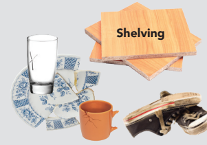
Miscellaneous Household Waste

KEEP THESE ITEMS OUT OF THE GARBAGE BIN.