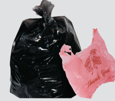
Plastic Bags & Wraps Retail shipping bags