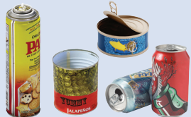
Aerosol & Metal Cans

KEEP THESE ITEMS OUT OF THE RECYCLE BIN.