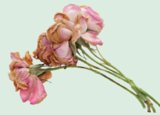
Flowers & Plant Debris