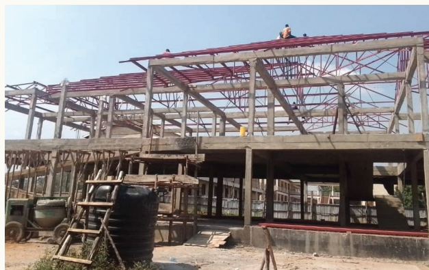
AFSS Admin Building