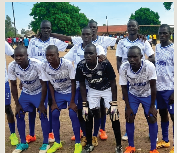
SHS football team reaches semi-final round