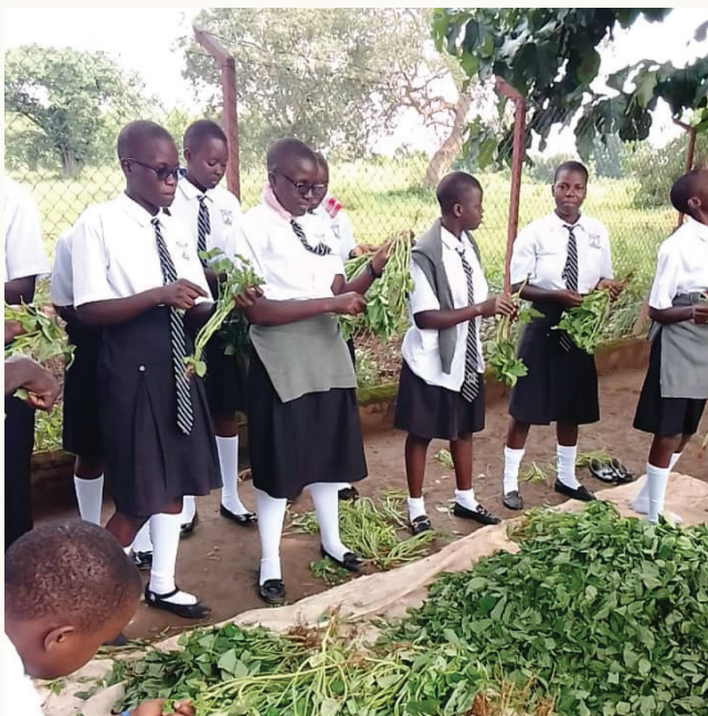
AFSS students helping prepare vegetables