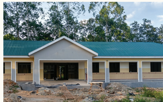
Providence Medical Clinic on AFSS campus