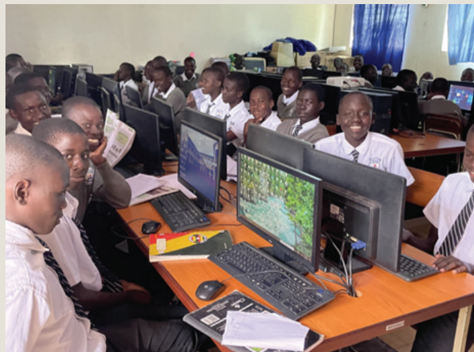
Students in computer lab