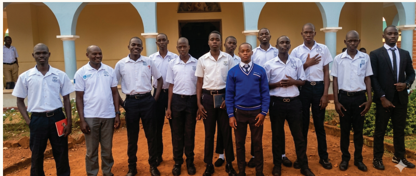
SHS students in front of the Sacred Heart of Jesus chapel