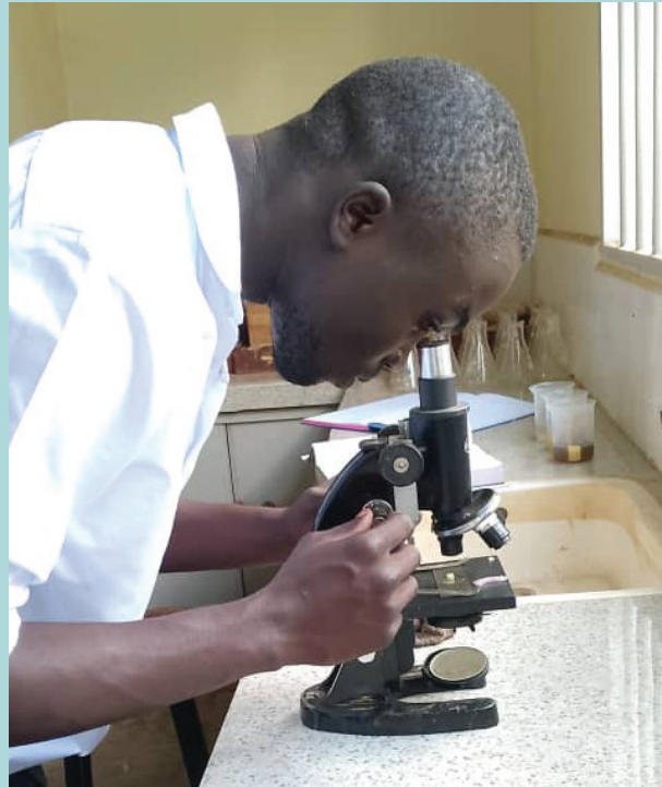
Renovated science lab on SHS campus