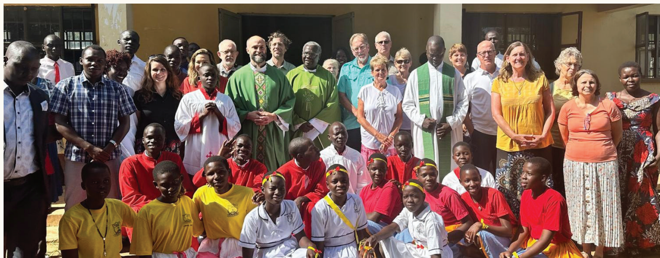
HFU 2023 Uganda Pilgrimage with members of IHM parish Minnetonka MN