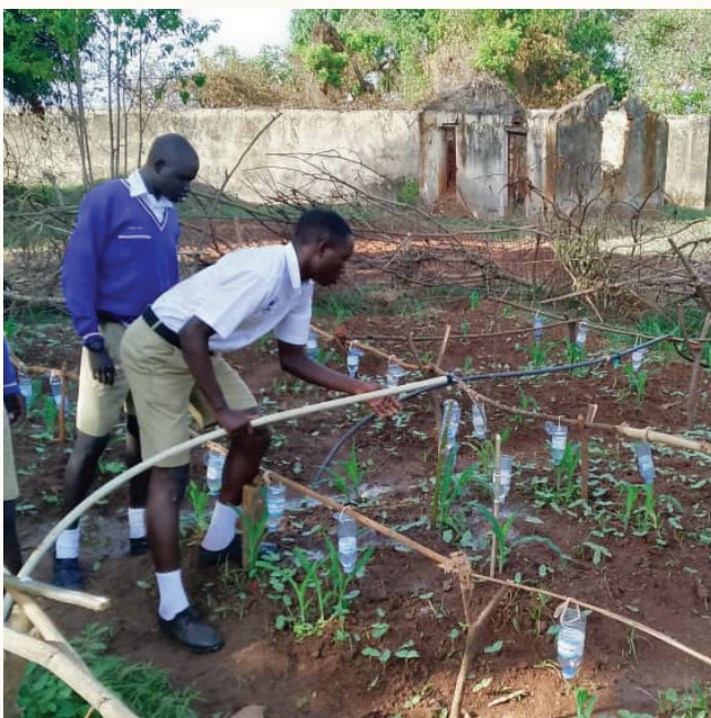
SHS students tending garden