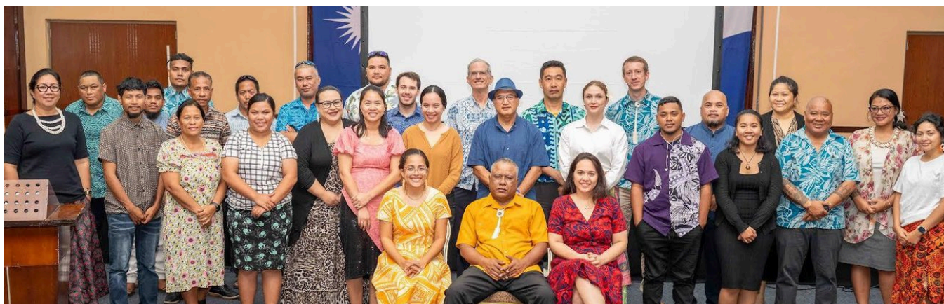
ID'S CLIMATE TEAM WITH MARSHALL ISLANDS' GOVERNMENT PARTNERS IN MAJURO

Former Foreign Minister, Republic of the Marshall Islands (in memoriam)